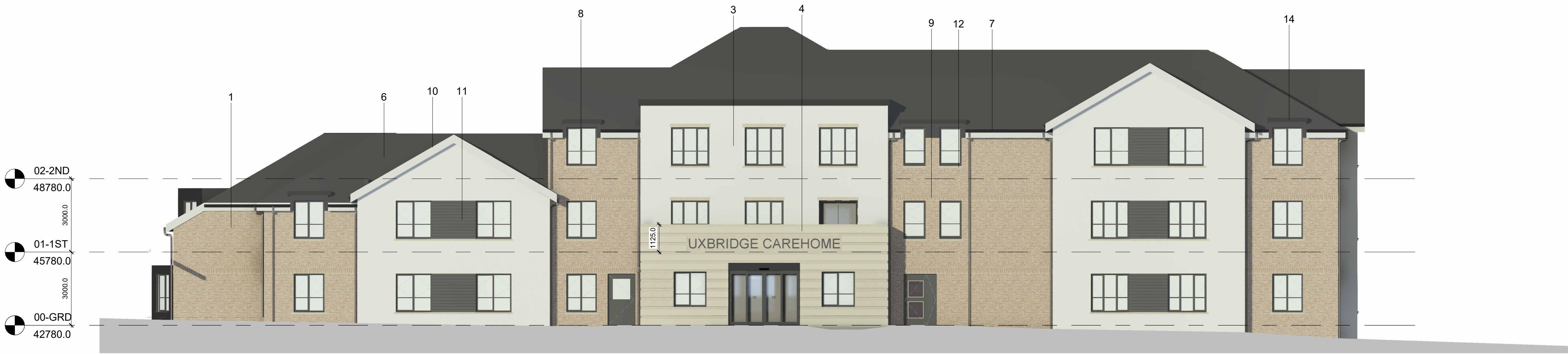
D - West - Planning 1 : 100