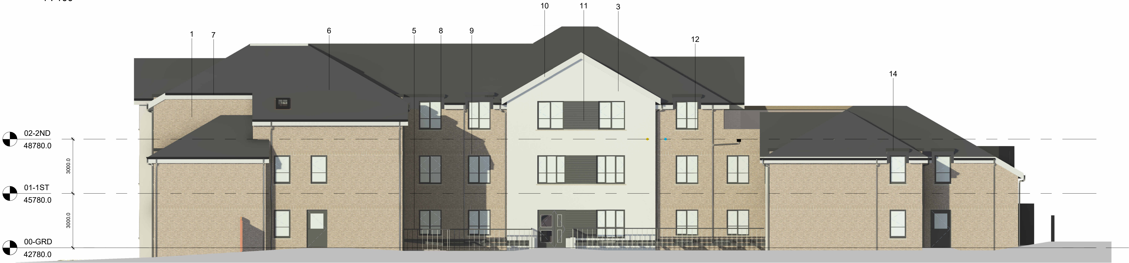
B - East - Planning 1 : 100