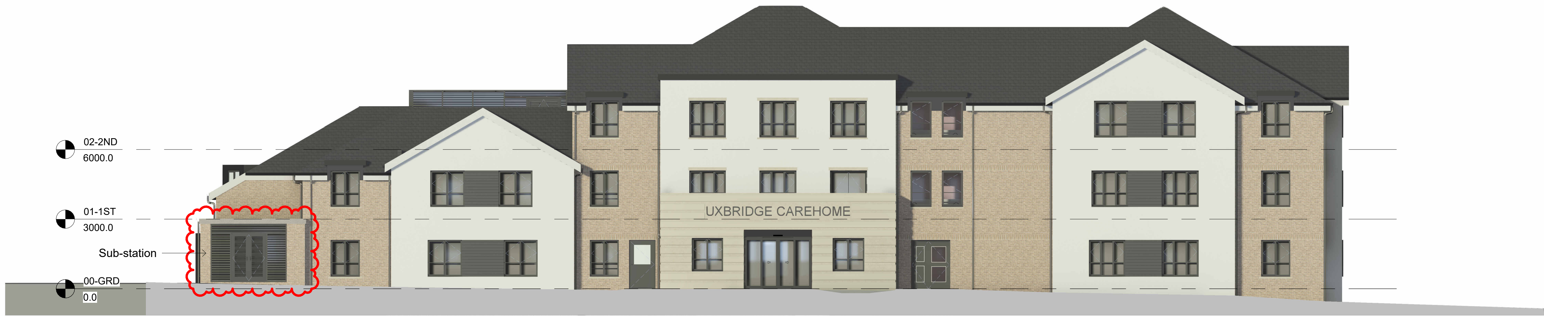
2 D - West NMA 1 : 100