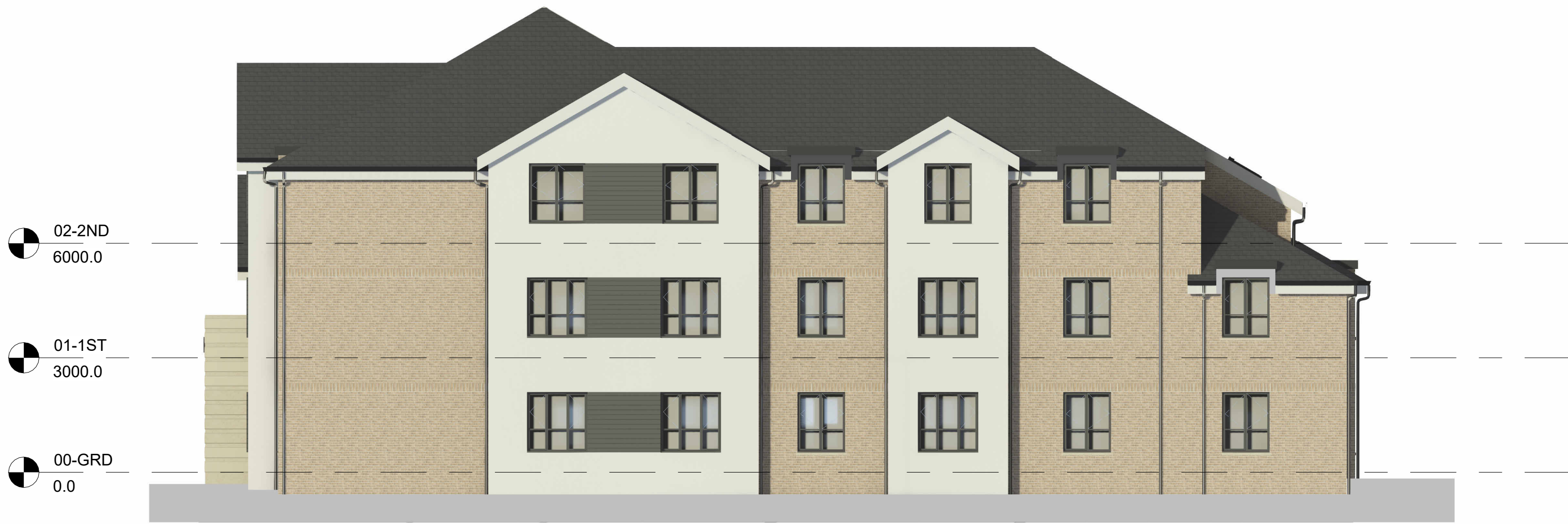
1 C - South NMA 1 : 100