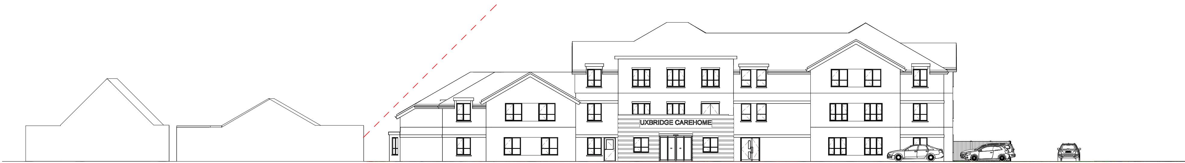
Street Scene Elevation - Field Heath Avenue 1 : 200