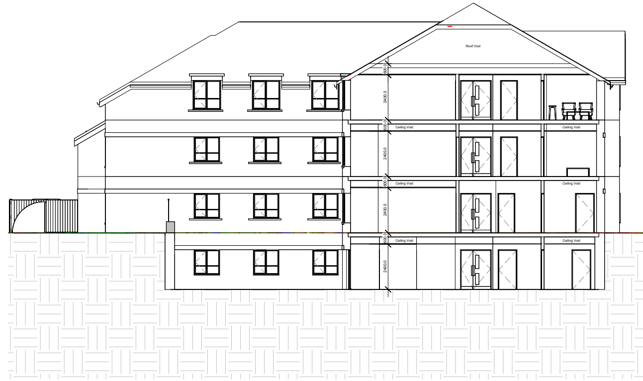
Site Section A 1 : 200