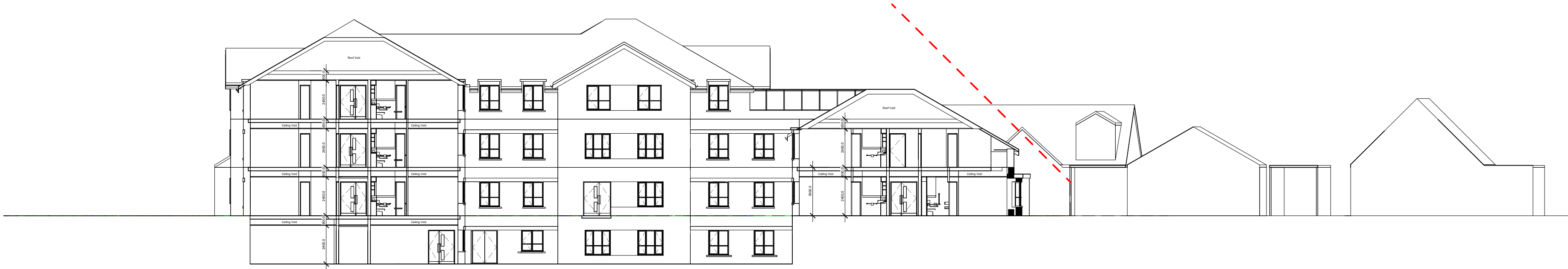
Site Section B 1 : 200