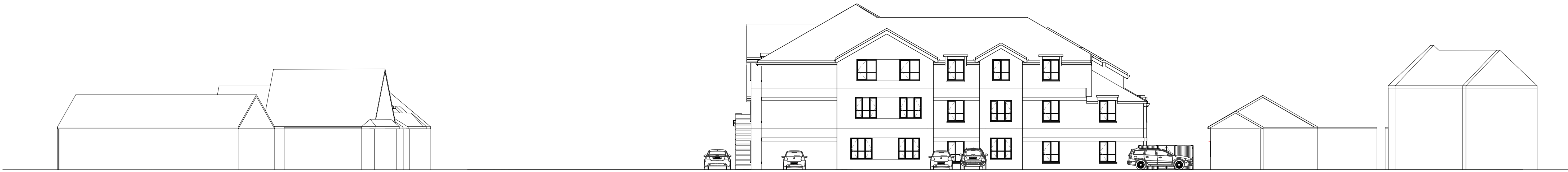
Street Scene Elevation - Field Heath Road 1 : 200