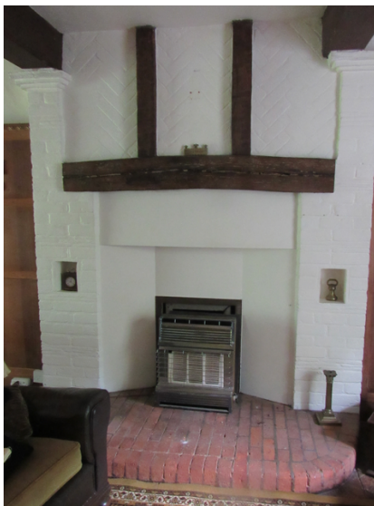
Living room fireplace