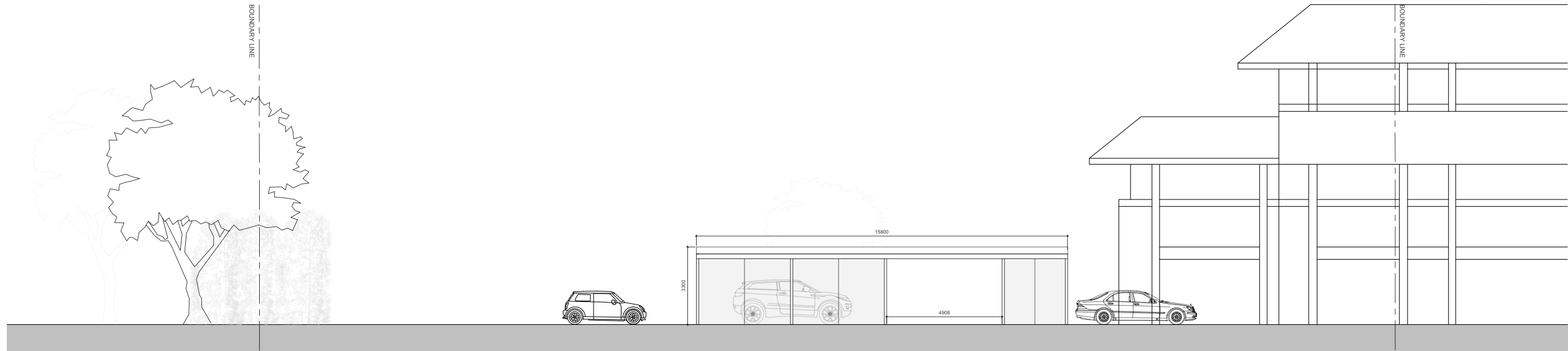
Proposed South elevation 1:200

This drawing is protected under Copyright and at no time should any portion of this drawing be reproduced or copied without the permission of the Architect. (Design Copyright Act 1968) This drawings must not be used for purposes other than that for which it is provided. It is supplied without liability for any errors or omissions. Drawings only to be scaled for planning application purposes, all dimensions to be checked on site. All drawings subject to Statutory Authority Approval.