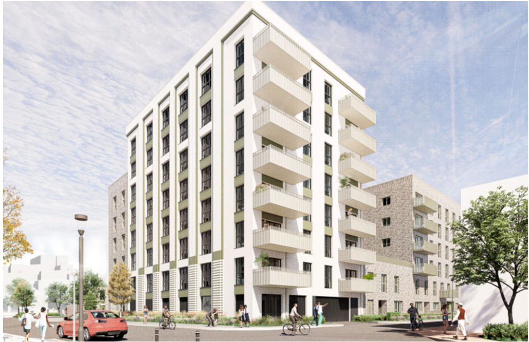
Hayes Town Centre