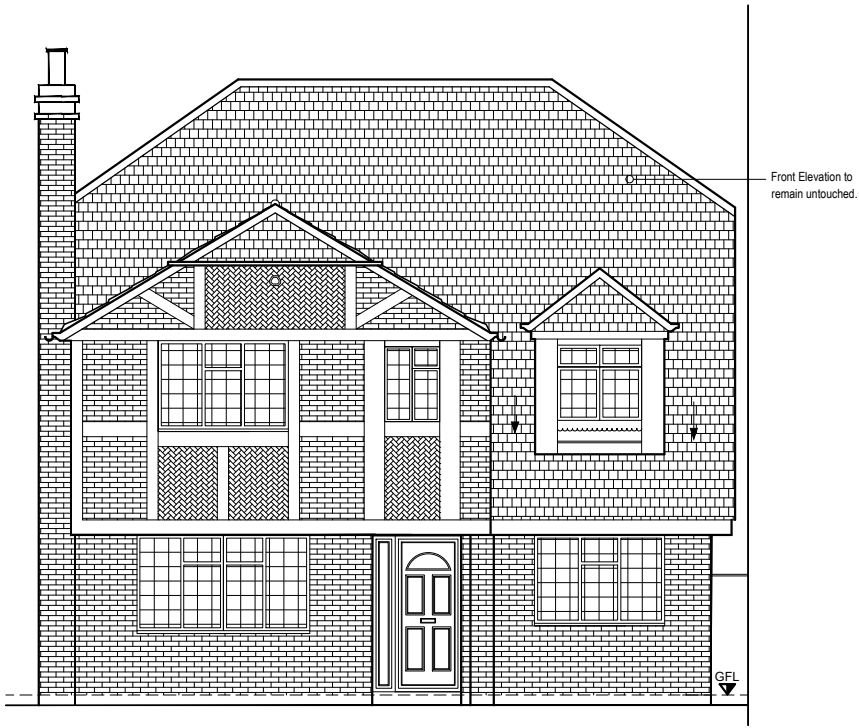
PROPOSED FRONT ELEVATION (to remain as existing) 1:100 @ A3