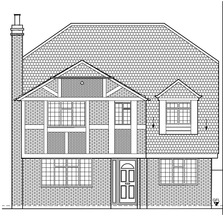
EXISTING FRONT ELEVATION 1:100 @ A3