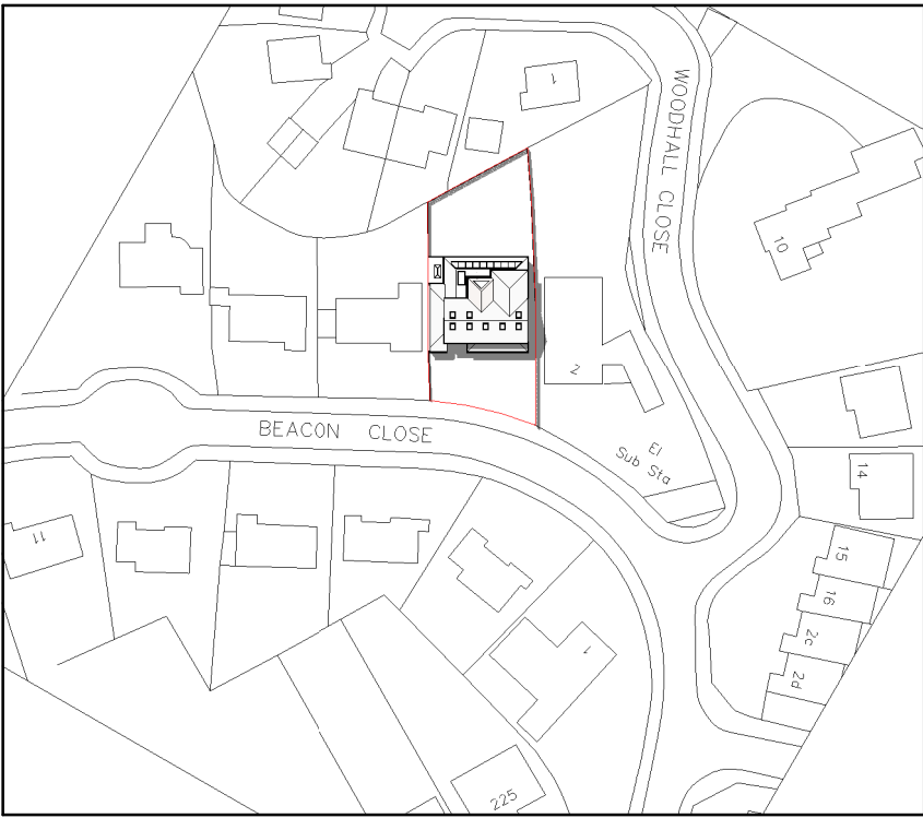
PP-PROPOSED LOCATION PLAN 1 : 1250