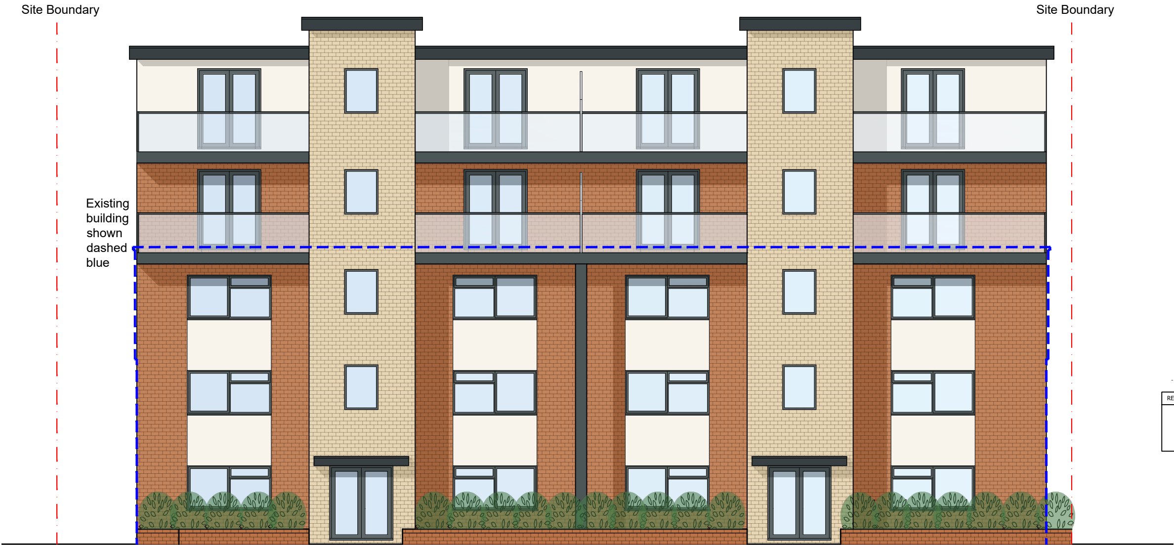
Proposed Front Elevation (South)

© This drawing is copyright. It is sent to you in confidence and must not be reproduced or disclosed to third parties without our prior permission. Do not scale from this drawing, other than for Local Authority Planning purposes. This drawing is to be read in conjunction with all relevant consultants, specialist manufacturers drawings and specifications. Any discrepancies in dimensions or details on or between these drawings should be drawn to our attention. All dimensions are in millimetres unless noted otherwise. Any surveyed information incorporated within this drawing cannot be guaranteed as accurate unless confirmed by fixed dimension.