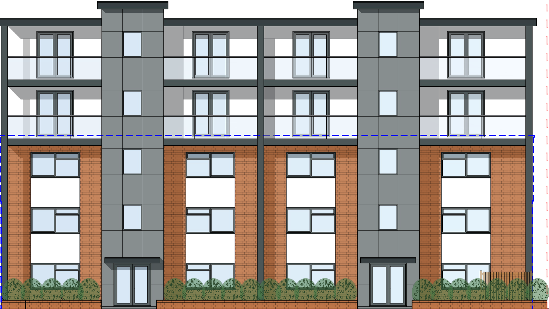
Proposed Front Elevation (South)