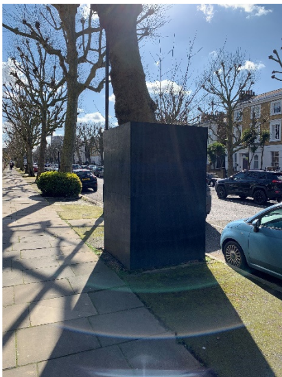
Above: tree box

The stem of T2 will also be protected using a ‘tree box’ comprising wooden hoarding to a height of 2.4m as per the photo below. The location the tree box is shown on the Tree Protection Plan (TPP) by a purple line.