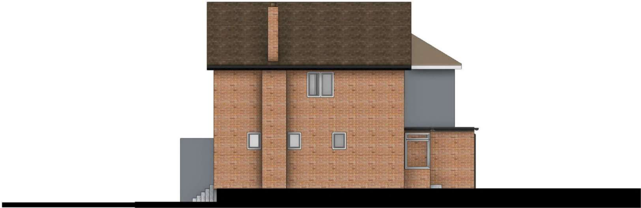
2 SIDE ELEVATION Scale: 1:100