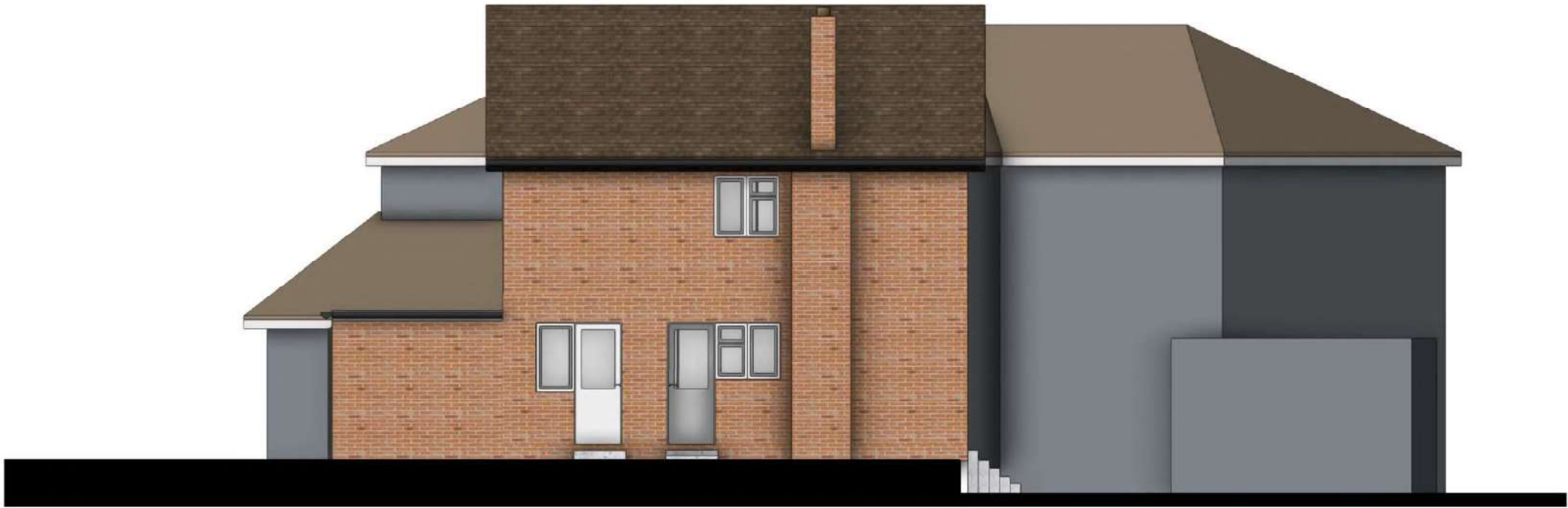
1 Side Elevation Scale: 1:100