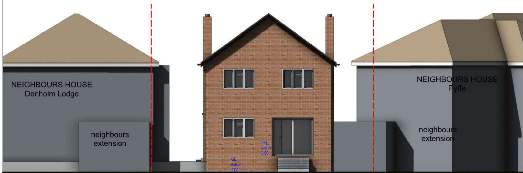
2 REAR ELEVATION Scale: 1:100