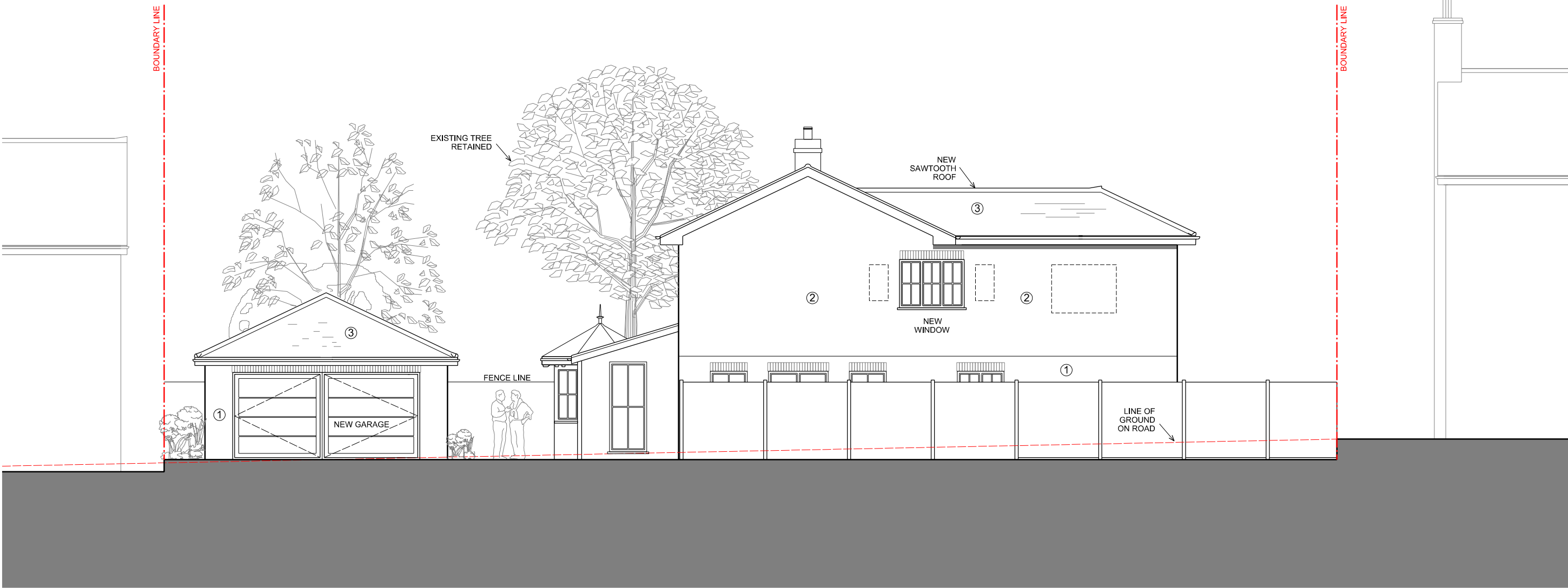
PROPOSE EAST ELEVATION