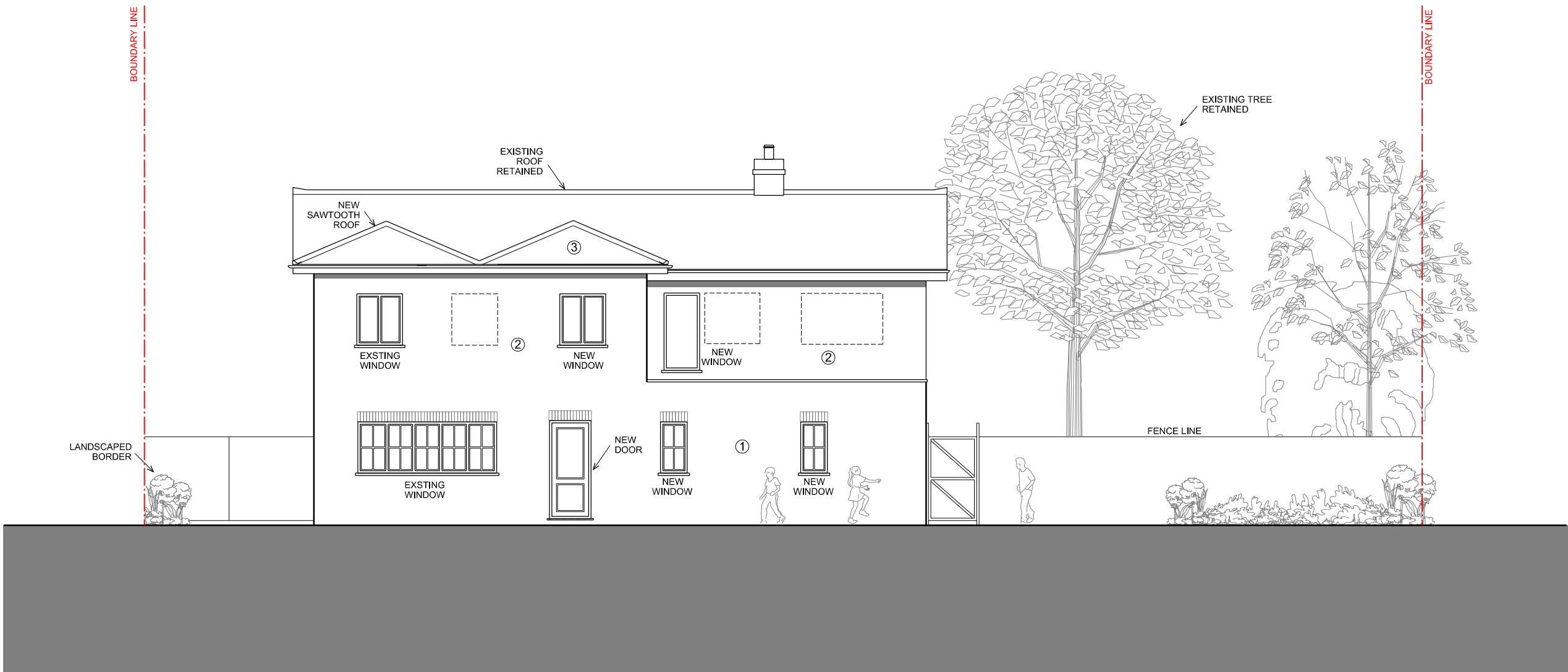
PROPOSE REAR ELEVATION