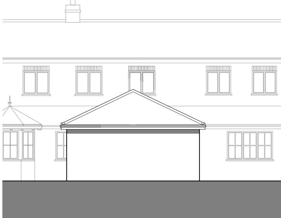
GARAGE - PROPOSED SOUTH ELEVATION