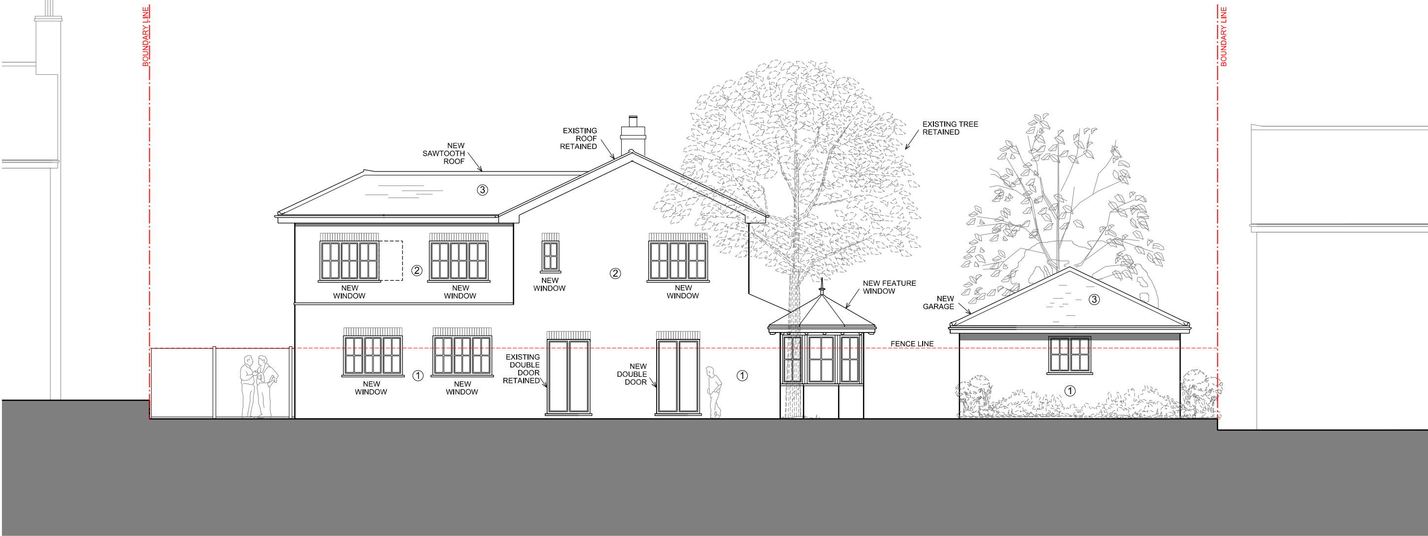
PROPOSE WEST ELEVATION