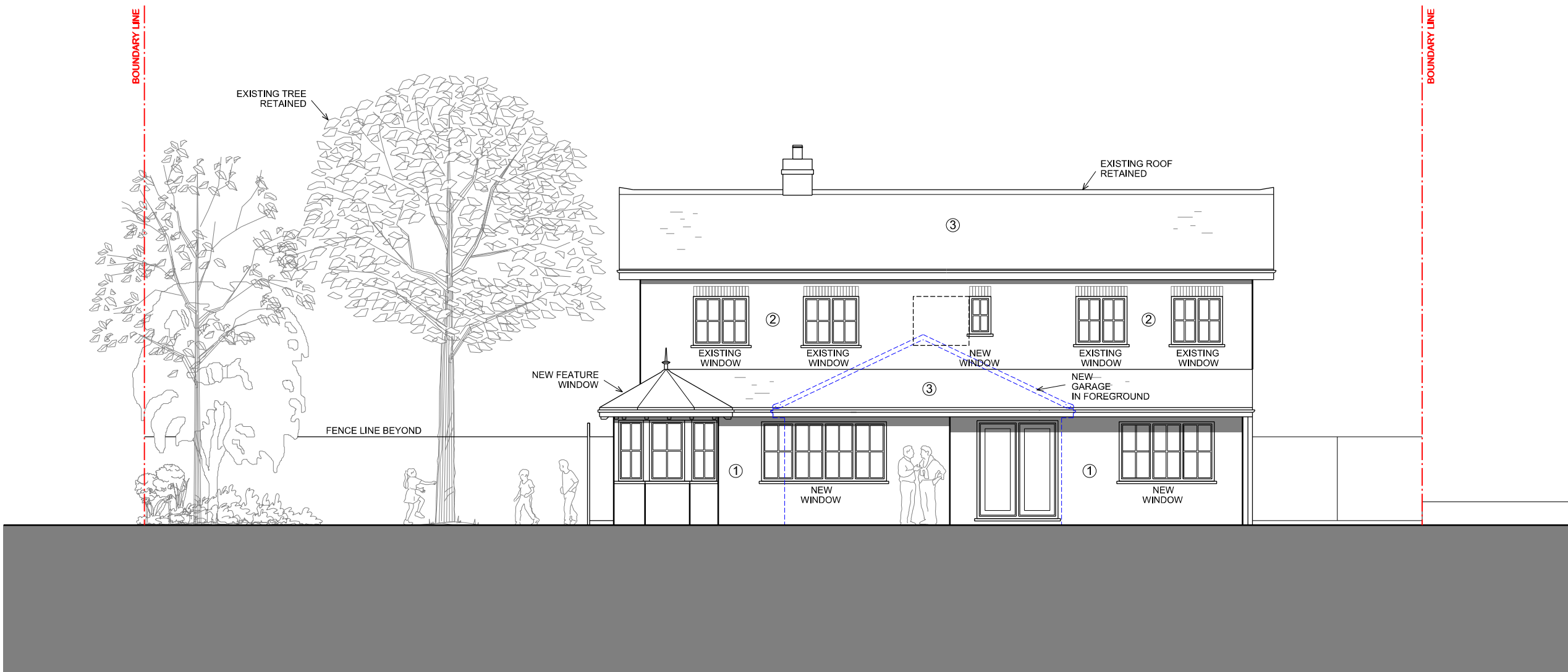
PROPOSE FRONT ELEVATION