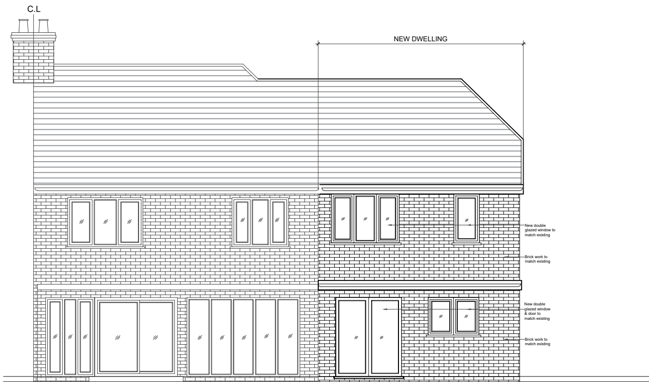
02- REAR ELEVATION