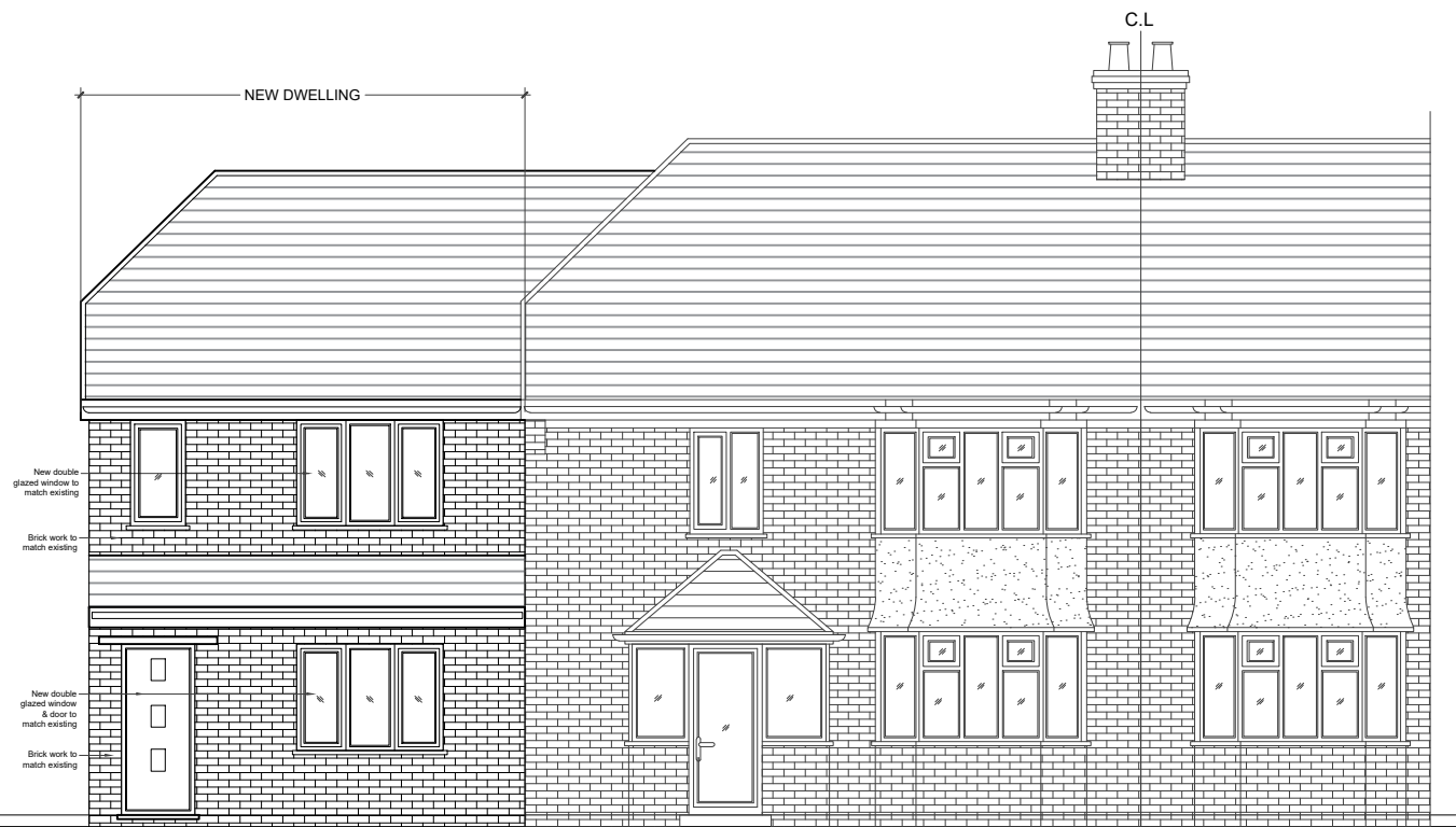
01- FRONT ELEVATION