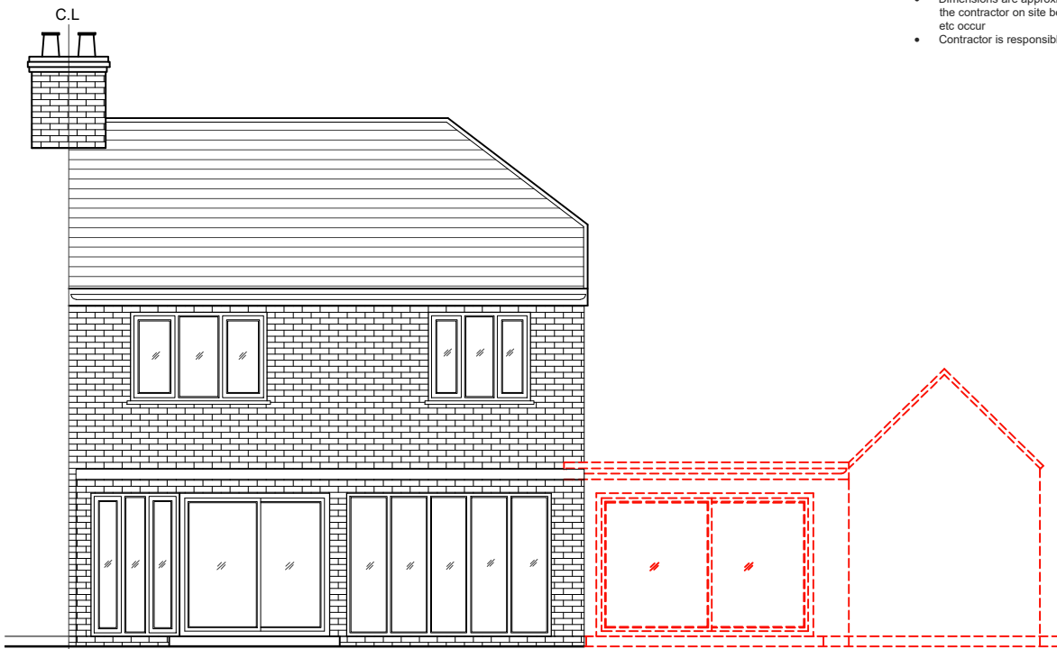
02 - REAR ELEVATION