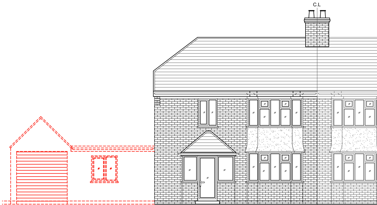
01 - FRONT ELEVATION