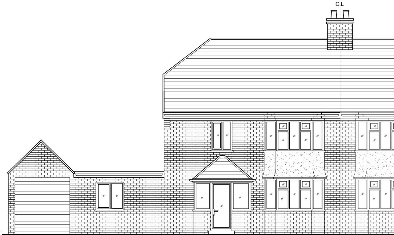
01 - FRONT ELEVATION