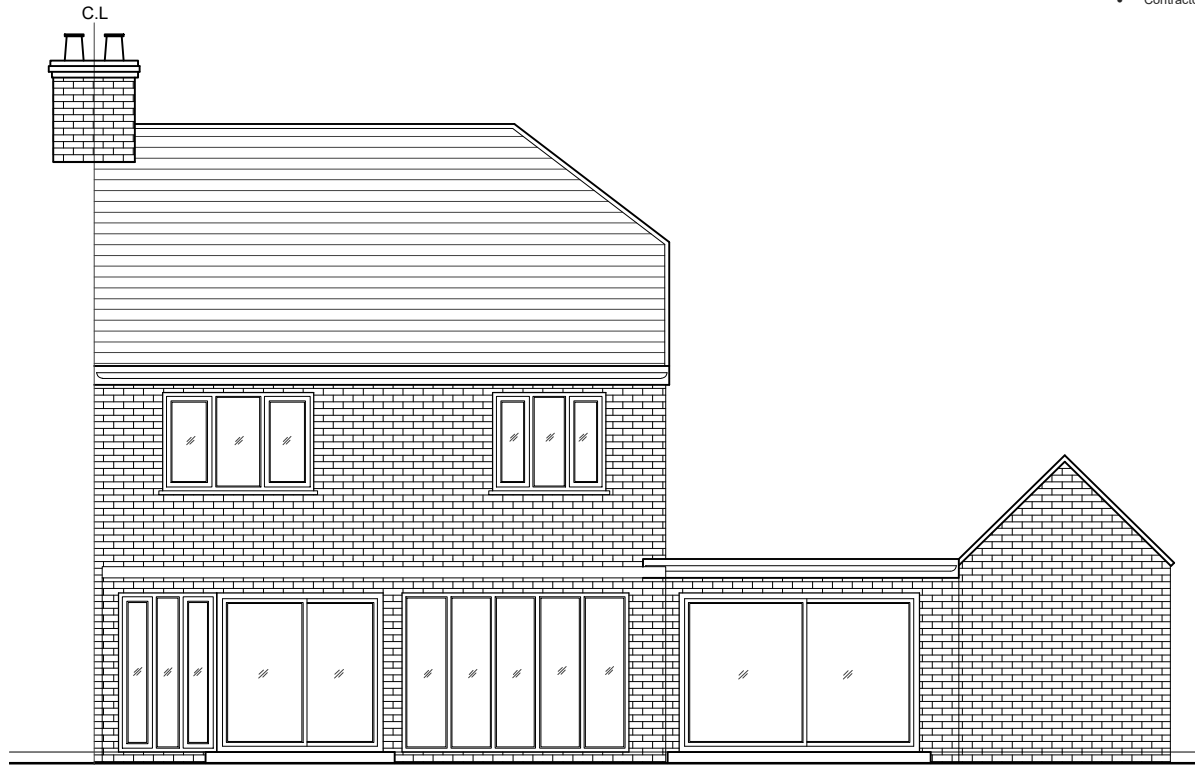
02 - REAR ELEVATION