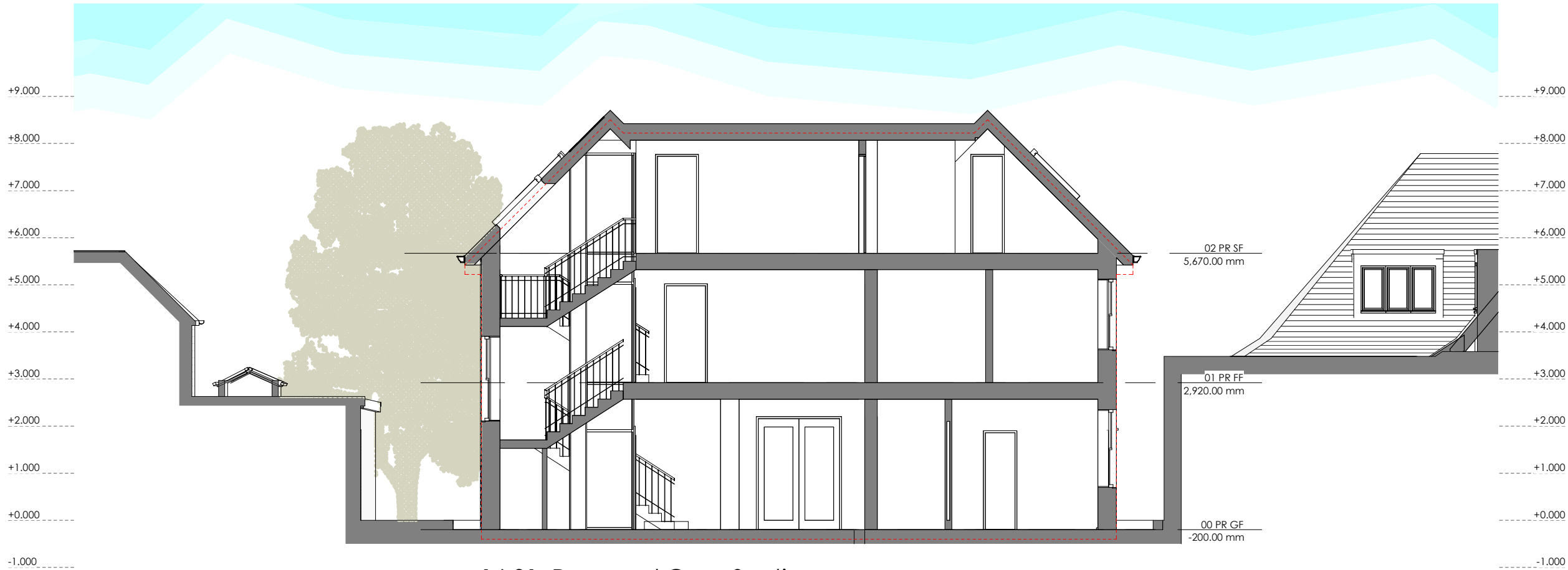
16.01 Proposed Cross Section

No.5 HARVIL ROAD ——— No.4 HARVIL ROAD - SITE EXTENTS ——— 3 HARVIL ROAD