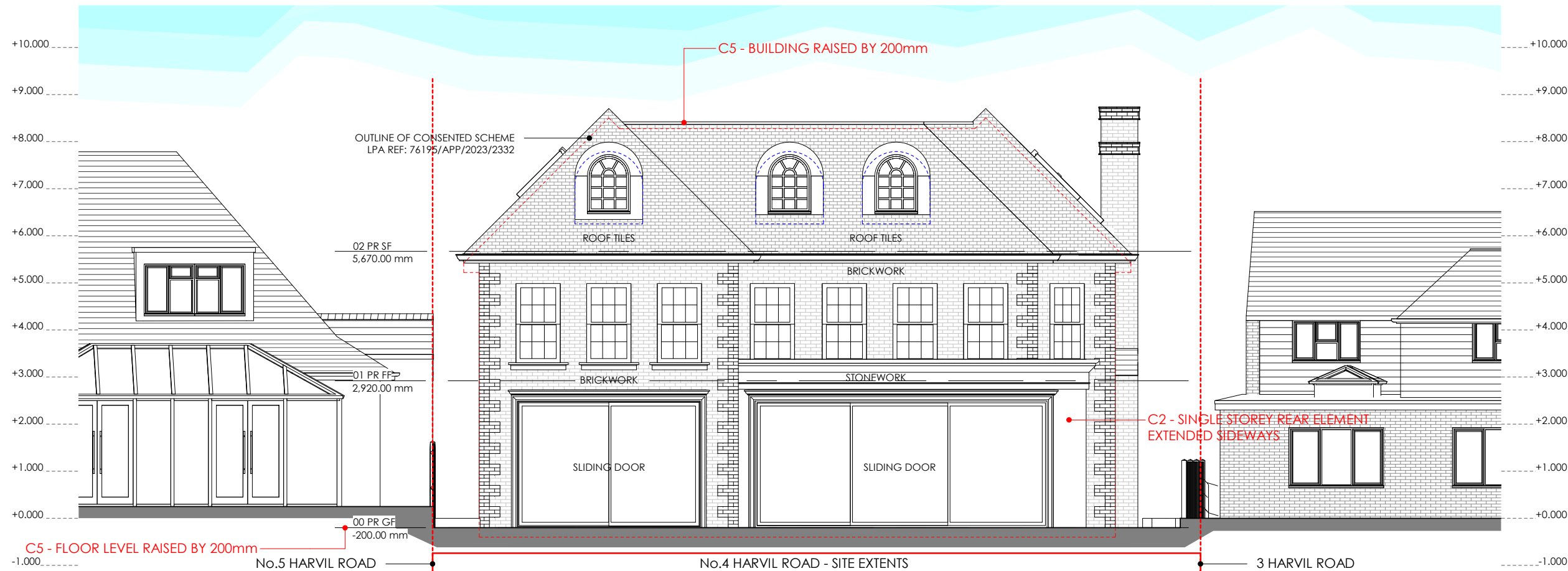
14.02 Proposed Rear Elevation - Garden

C354-14 Proposed Front and Rear Elevations (Rev C)