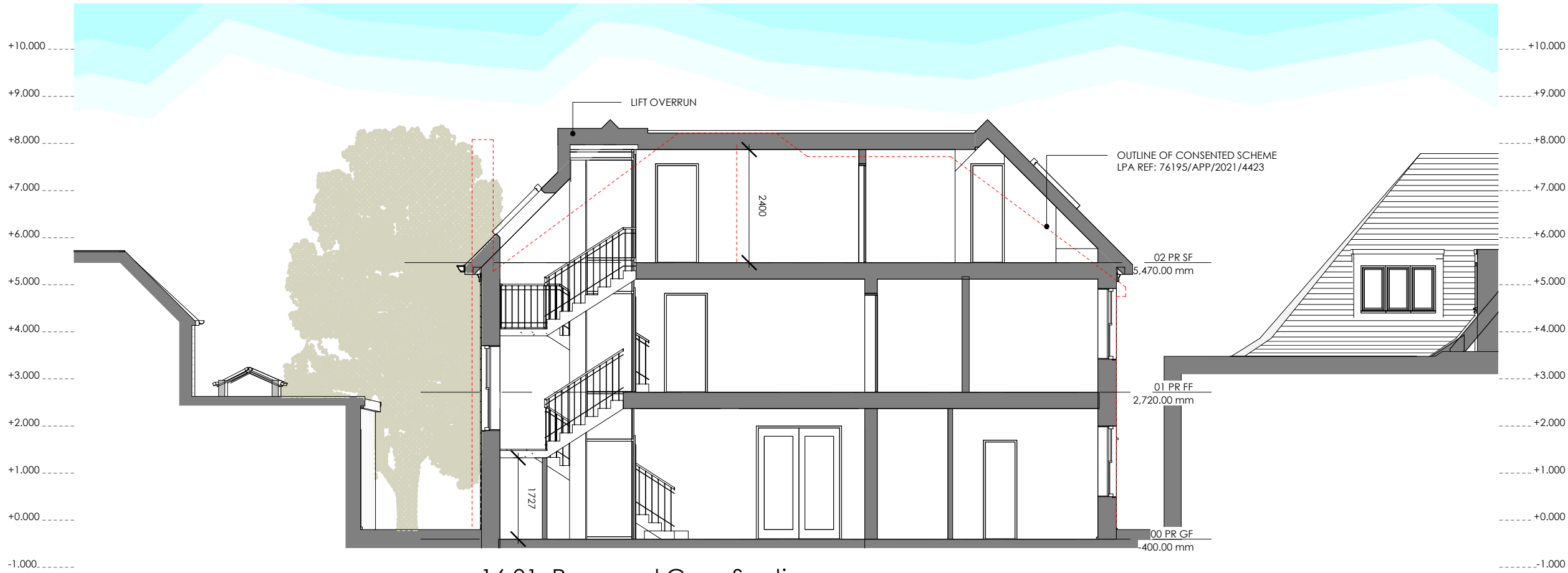
16.01 Proposed Cross Section