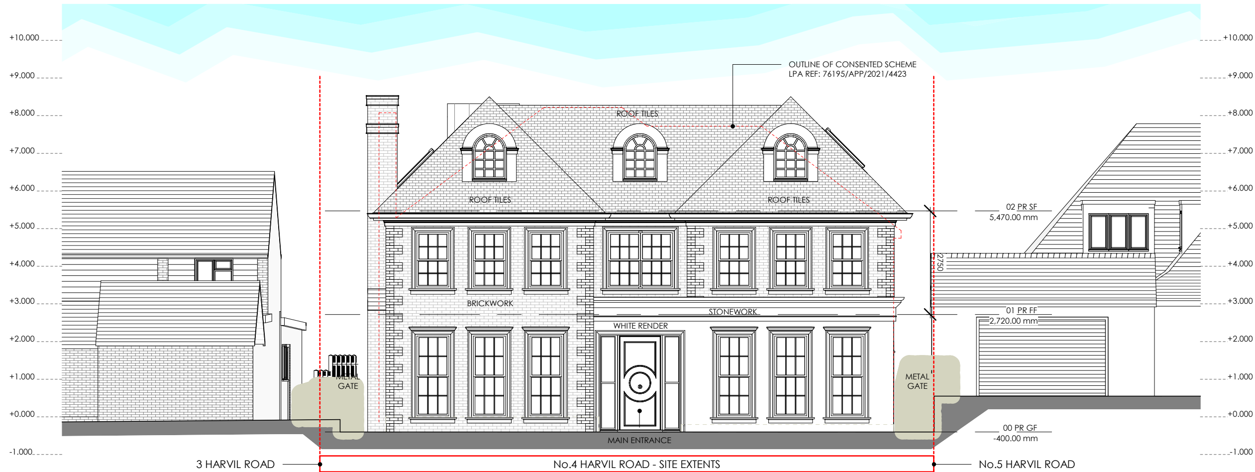
14.01 Proposed Front Elevation - Harvil Road