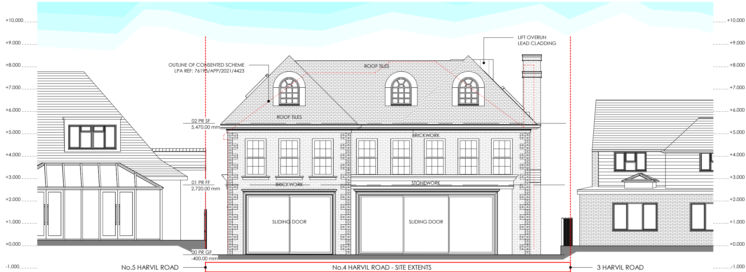
14.02 Proposed Rear Elevation - Garden

THE CONTRACTOR SHOULD CHECK ALL DIMENSIONS ON SITE. NO DIMENSIONS TO BE SCALED FROM THIS DRAWING. NO PART OF THIS DRAWING IS TO BE COPIED OR REPRODUCED WITHOUT THE PRIOR CONSENT OF THE ARCHITECT. IT IS THE CONTRACTORS RESPONSIBILITY TO ENSURE COMPLIANCE WITH THE BUILDING REGULATIONS. ALL RIGHTS DESCRIBED IN CHAPTER IV OF THE COPYRIGHT, DESIGNS AND PATENTS ACT 1988 HAVE GENERALLY BEEN ASSERTED. ©