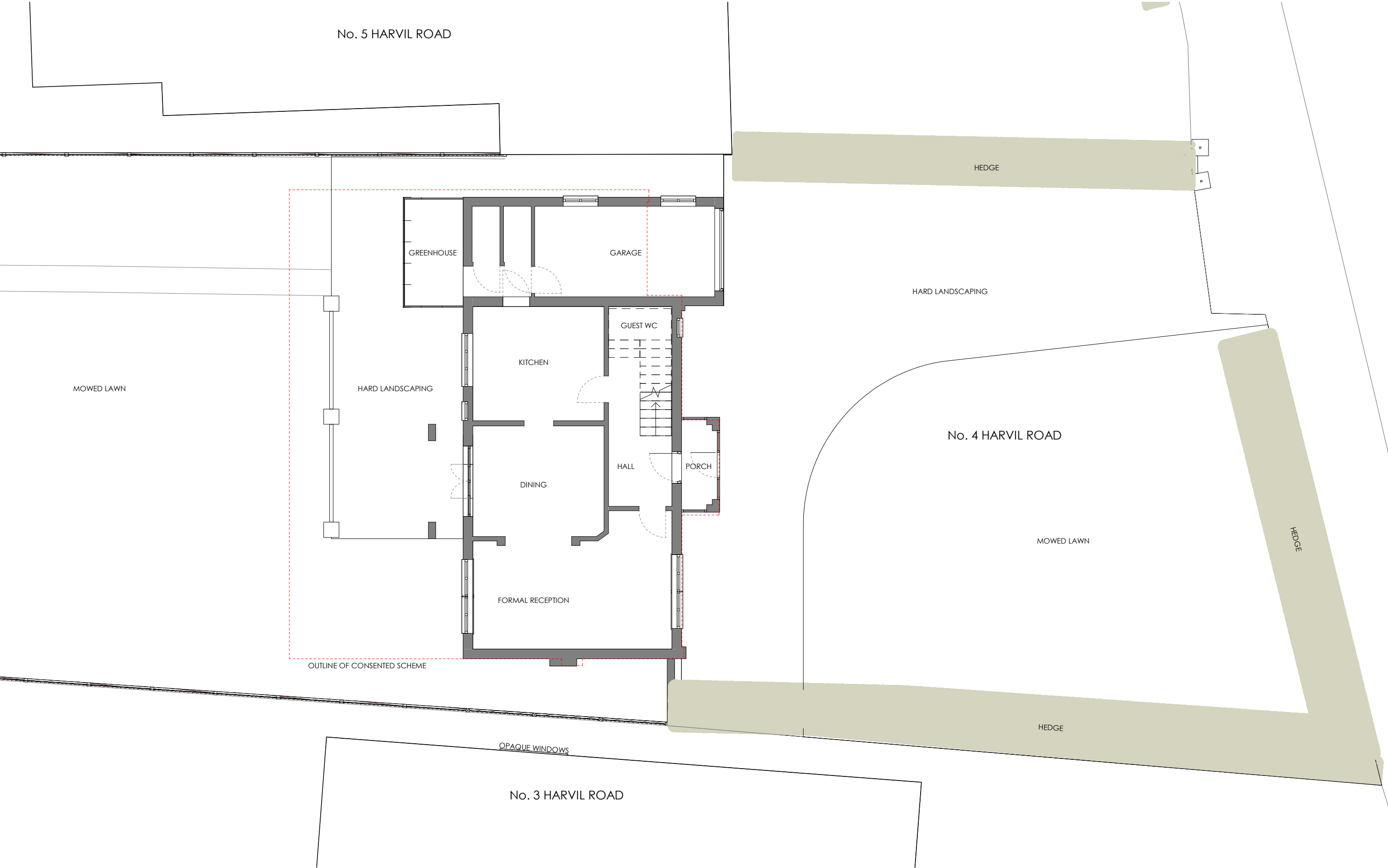
C354 - 03 Existing Ground Floor Plan (Rev A)