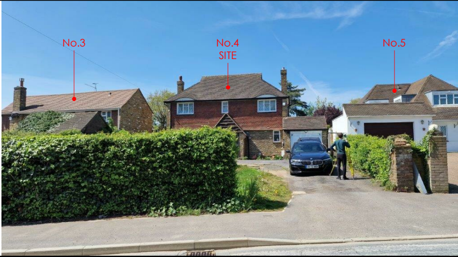
05. STREETVIEW OF Nos 3, 4 & 5 HARVIL ROAD