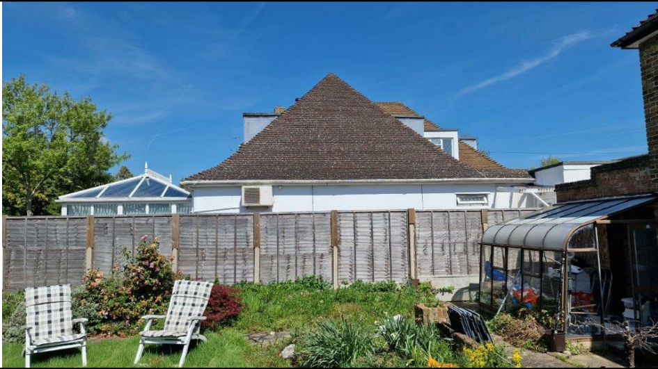
08. SIDE VIEW OF No.5 HARVIL ROAD