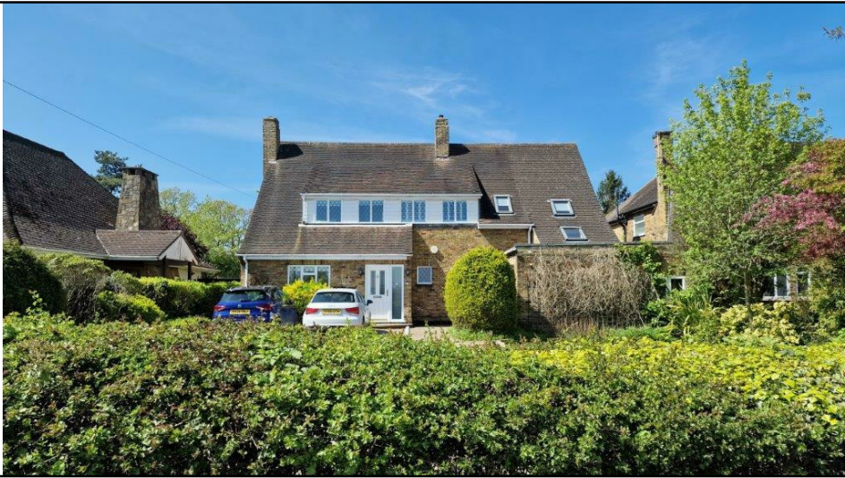
01. FRONT VIEW OF No.3 HARVIL ROAD