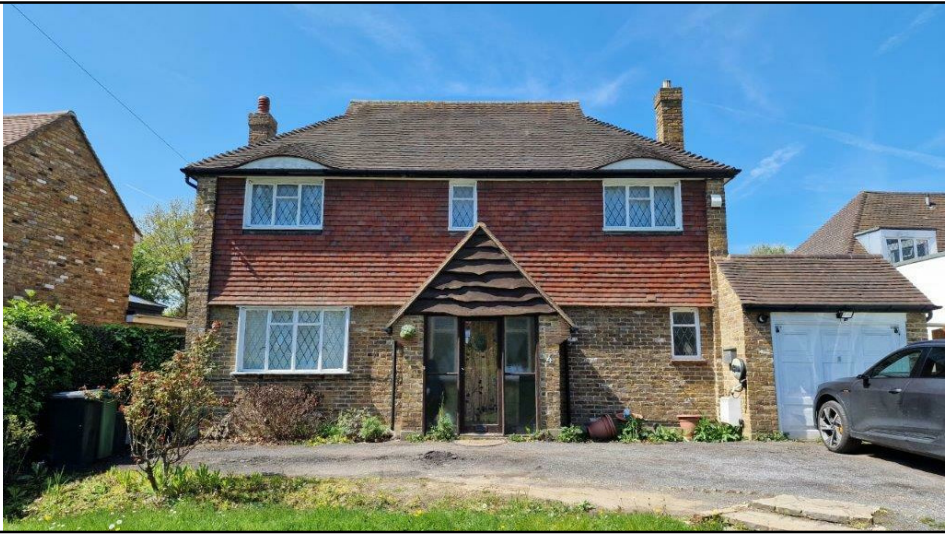
02. FRONT VIEW OF No.4 HARVIL ROAD (APPLICATION SITE)