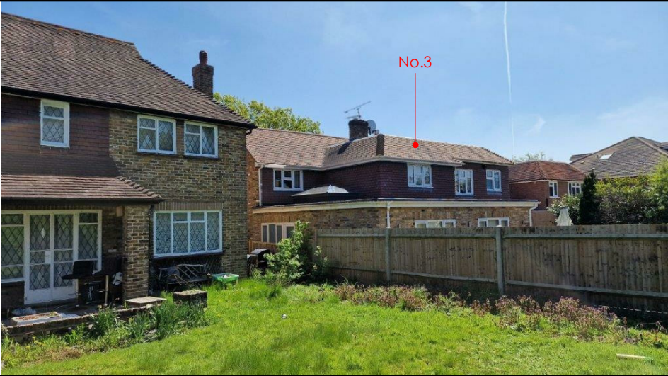
09. REAR VIEW No.3 HARVIL ROAD