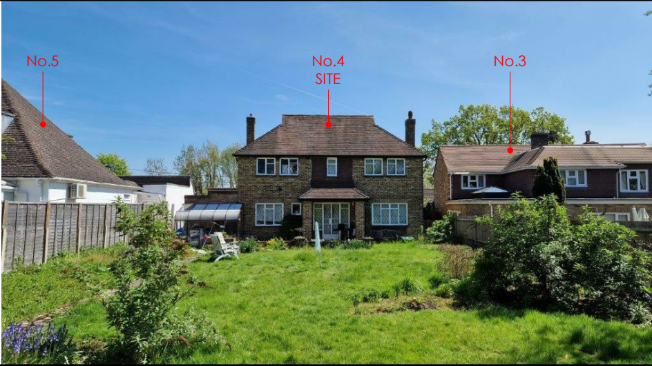
06. REAR VIEW OF SITE