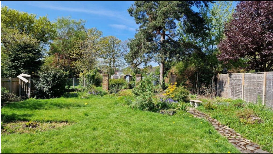
07. VIEW OF GARDEN FROM HOUSE