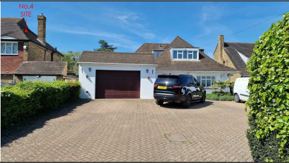
03. FRONT VIEW OF No.5 HARVIL ROAD