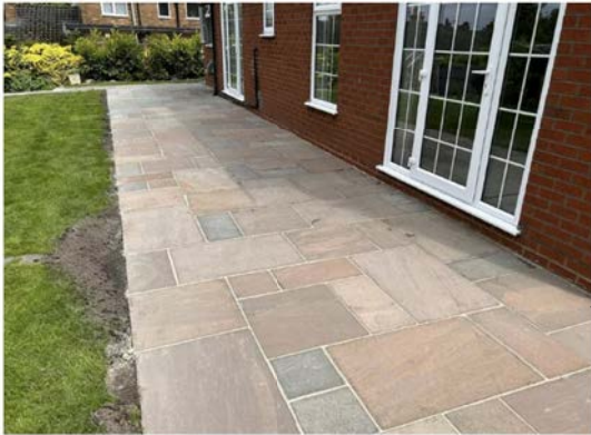
NATURAL SANDSTONE PATIO PAVING COLOUR - AUTUMN BROWN