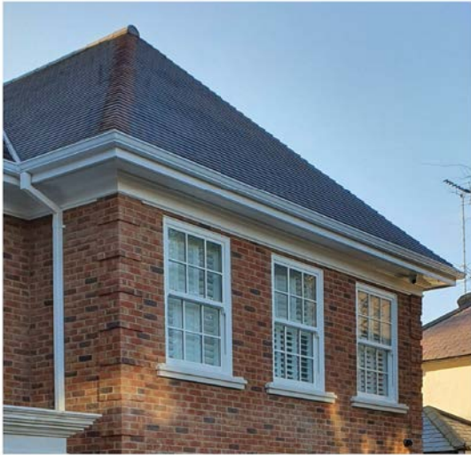
ALUMINIUM EXTRUDED RAINWATER GOODS COLOUR - WHITE