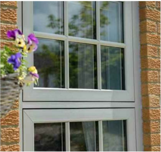
UPVC CASEMENT WINDOWS WITH ASTRGAL BARS COLOUR - AGATE GREY WITH WOODGRAIN