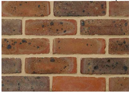
WIENERBERGER TERCA HAND MOULDED COLOUR - MARPESSA MULTI