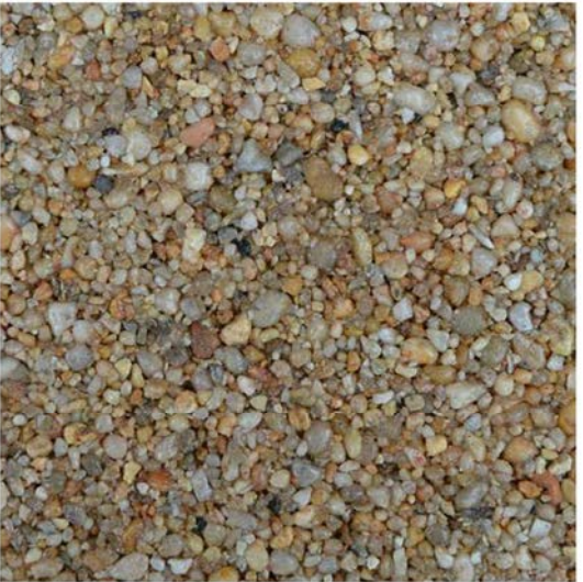
CLEARSTONE RESIN DRIVEWAY COLOUR - CHESIL ON 70mm SUDS COMPLIANT PERMEABLE TARMAC ON SUDS COMPLIANT BASE