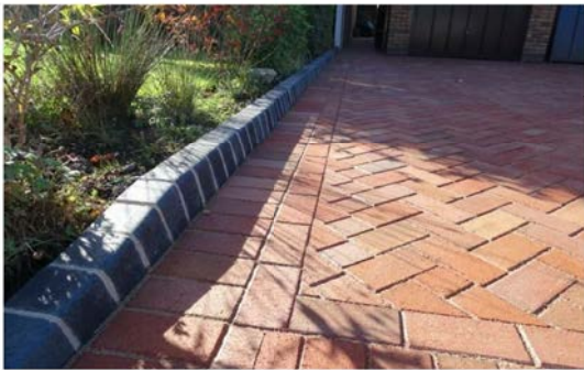
WIENERBERGER PENTER PAVER - UNSANDED COLOUR - SYCAMORE

THE CONTRACTOR SHOULD CHECK ALL DIMENSIONS ON SITE. NO DIMENSIONS TO BE SCALED FROM THIS DRAWING (EXCEPT FOR PLANNING PURPOSES). NO PART OF THIS DRAWING IS TO BE COPIED OR REPRODUCED WITHOUT THE PRIOR CONSENT OF THE ARCHITECT. IT IS THE CONTRACTORS RESPONSIBILITY TO ENSURE COMPLIANCE WITH THE BUILDING REGULATIONS. ALL RIGHTS DESCRIBED IN CHAPTER IV OF THE COPYRIGHT, DESIGNS AND PATENTS ACT 1988 HAVE GENERALLY BEEN ASSERTED. ©