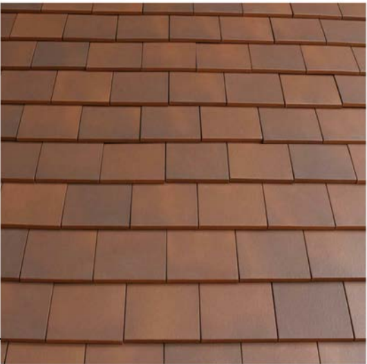
MARLEY ACME SINGLE CAMBER PLAIN ROOF TILE COLOUR - MIXED BRINDLE