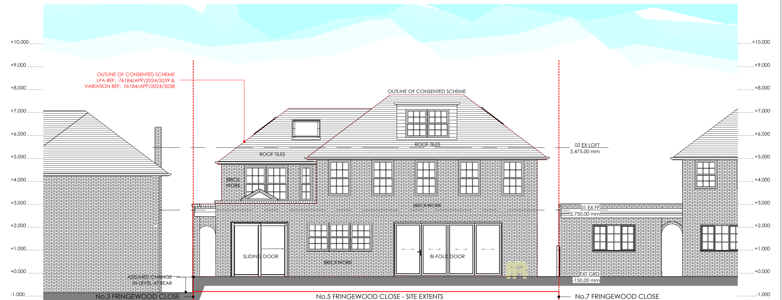
24.02 Proposed Rear Elevation - Garden

C374 - 24 Proposed Front & Rear Elevations (Rev E)