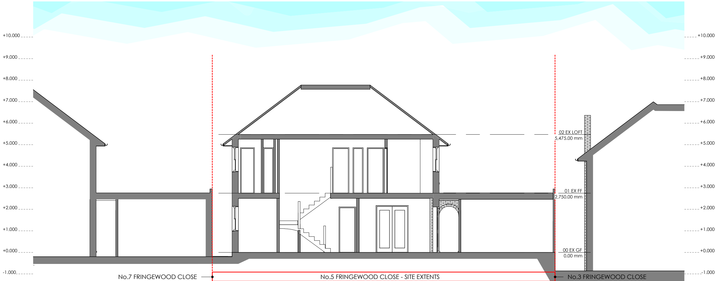
16.02 Existing Cross Section Through House

THE CONTRACTOR SHOULD CHECK ALL DIMENSIONS ON SITE. NO DIMENSIONS TO BE SCALED FROM THIS DRAWING. NO PART OF THIS DRAWING IS TO BE COPIED OR REPRODUCED WITHOUT THE PRIOR CONSENT OF THE ARCHITECT. IT IS THE CONTRACTORS RESPONSIBILITY TO ENSURE COMPLIANCE WITH THE BUILDING REGULATIONS. ALL RIGHTS DESCRIBED IN CHAPTER IV OF THE COPYRIGHT, DESIGNS AND PATENTS ACT 1988 HAVE GENERALLY BEEN ASSERTED. ©