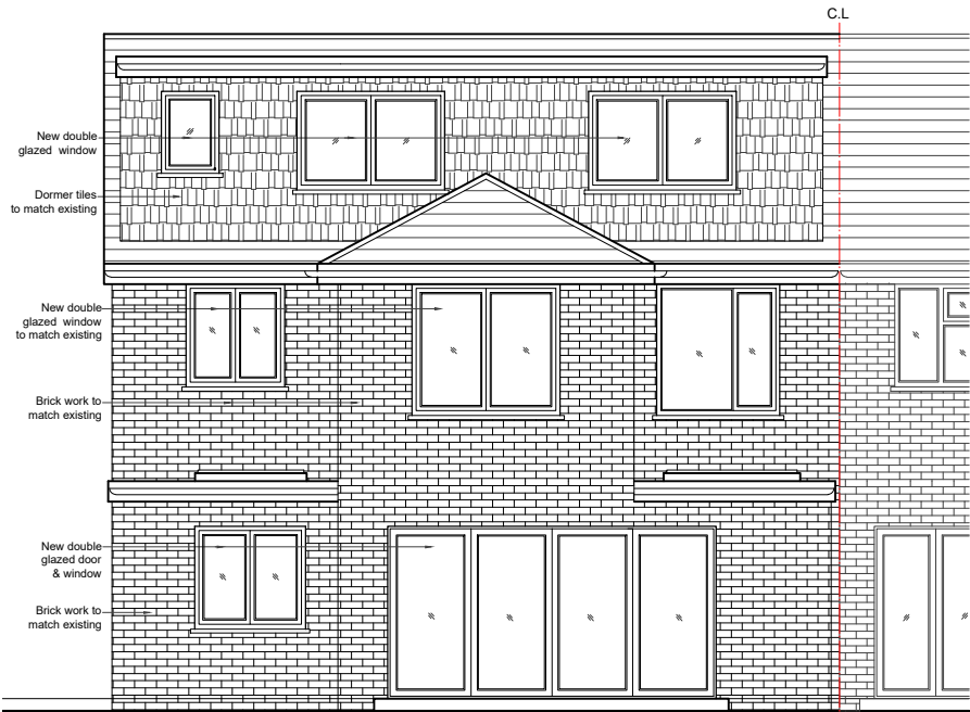
02 - REAR ELEVATION