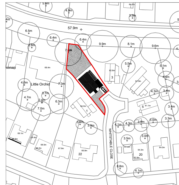
EXISTING - LOCATION PLAN 1:1250