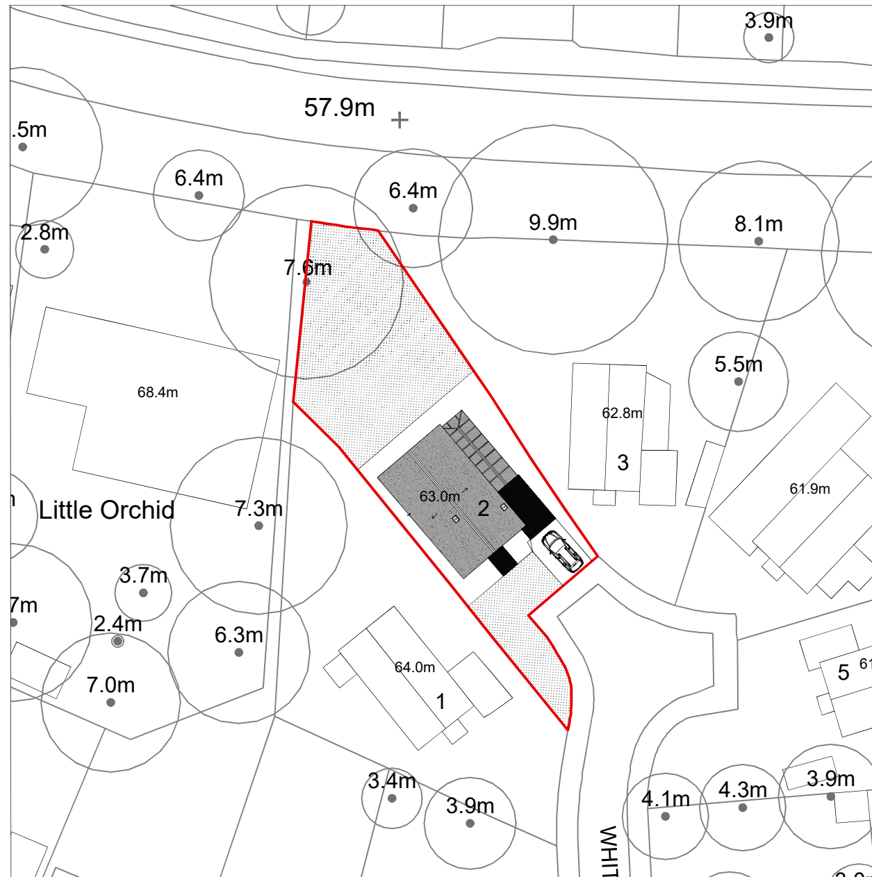
EXISTING - BLOCK PLAN 1:500