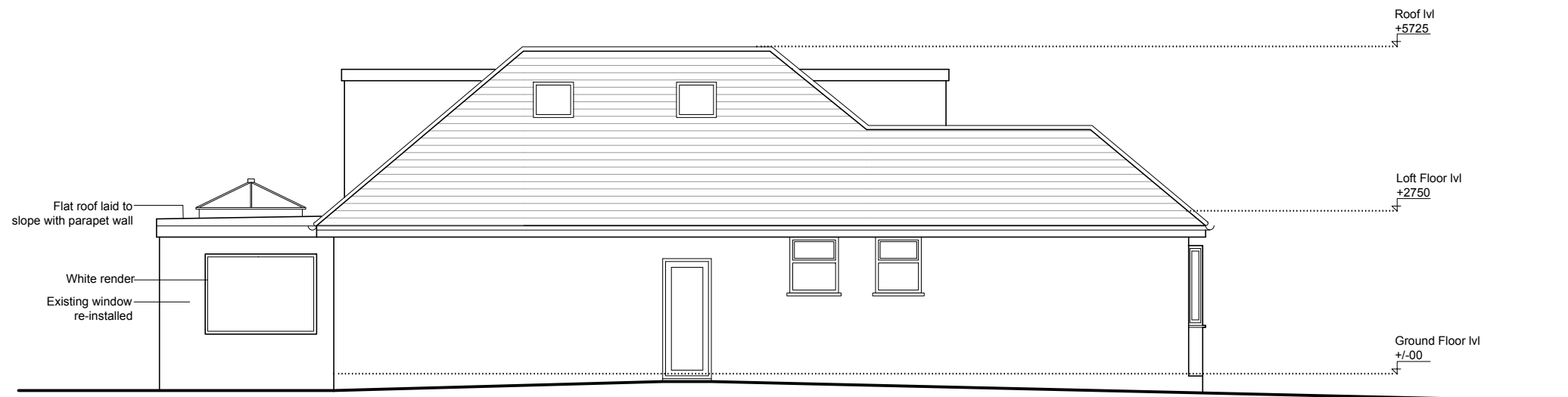
PROPOSED SIDE (LHS) ELEVATION