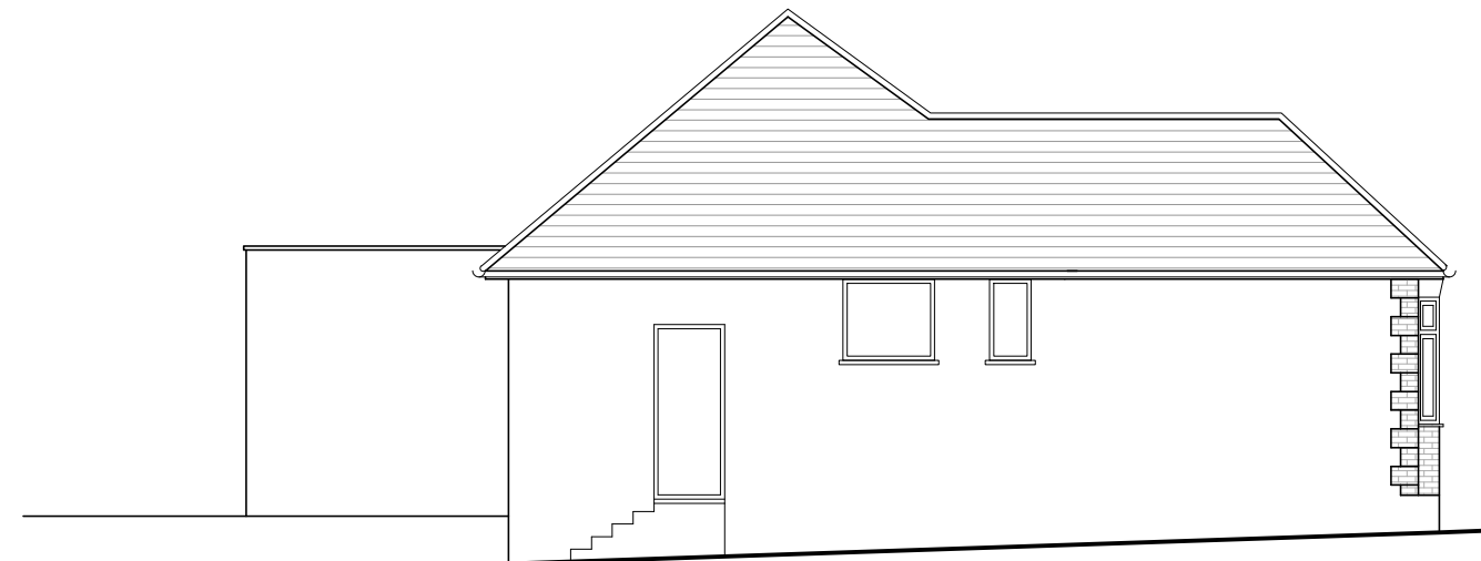
EXISTING SIDE (LHS) ELEVATION