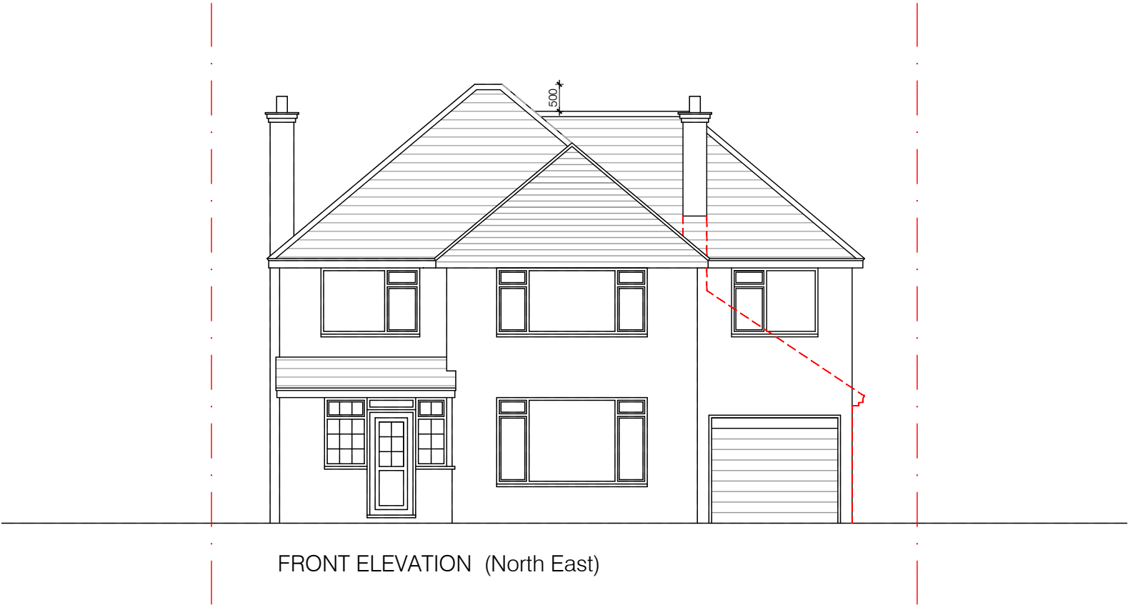
FRONT ELEVATION (North East)