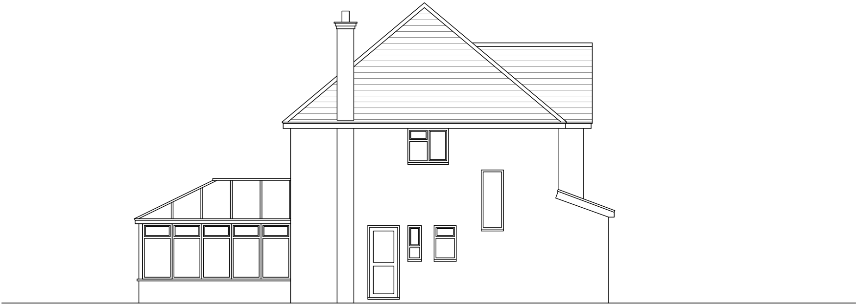
SIDE ELEVATION (South East)

© This drawing is copyright. It is sent to you in confidence and must not be reproduced or disclosed to third parties without our prior permission.