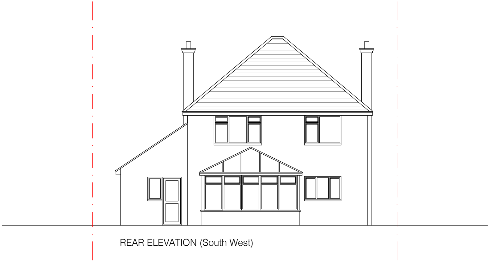
REAR ELEVATION (South West)