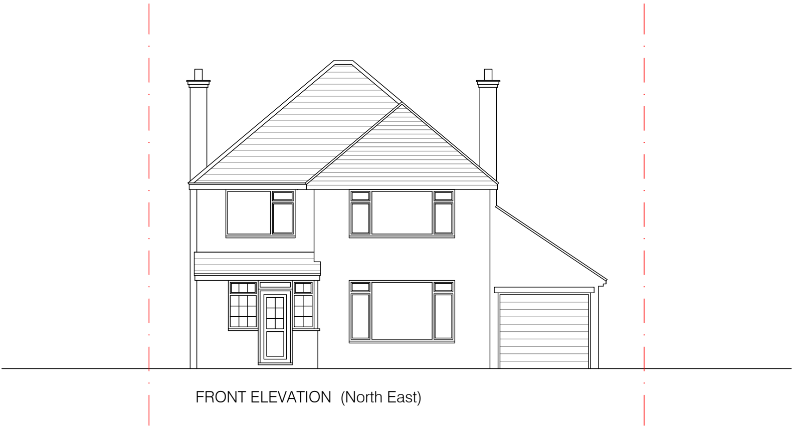
FRONT ELEVATION (North East)