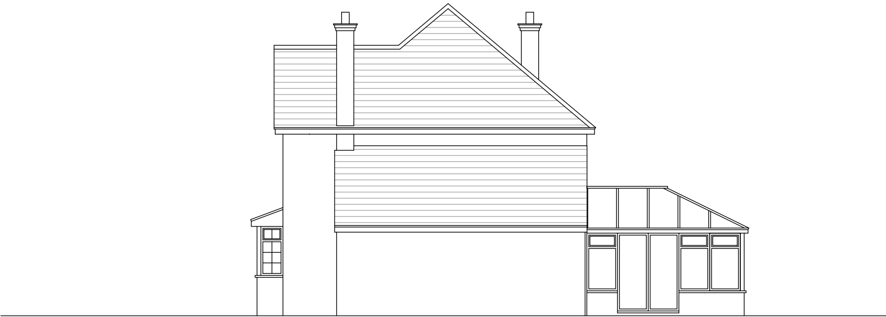
SIDE ELEVATION (North West)

© This drawing is copyright. It is sent to you in confidence and must not be reproduced or disclosed to third parties without our prior permission.