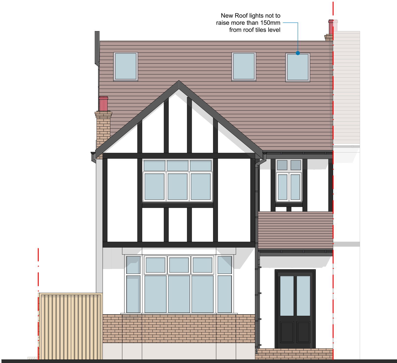
Proposed Front Elevation 1:50

New Roof lights not to raise more than 150mm from roof tiles level