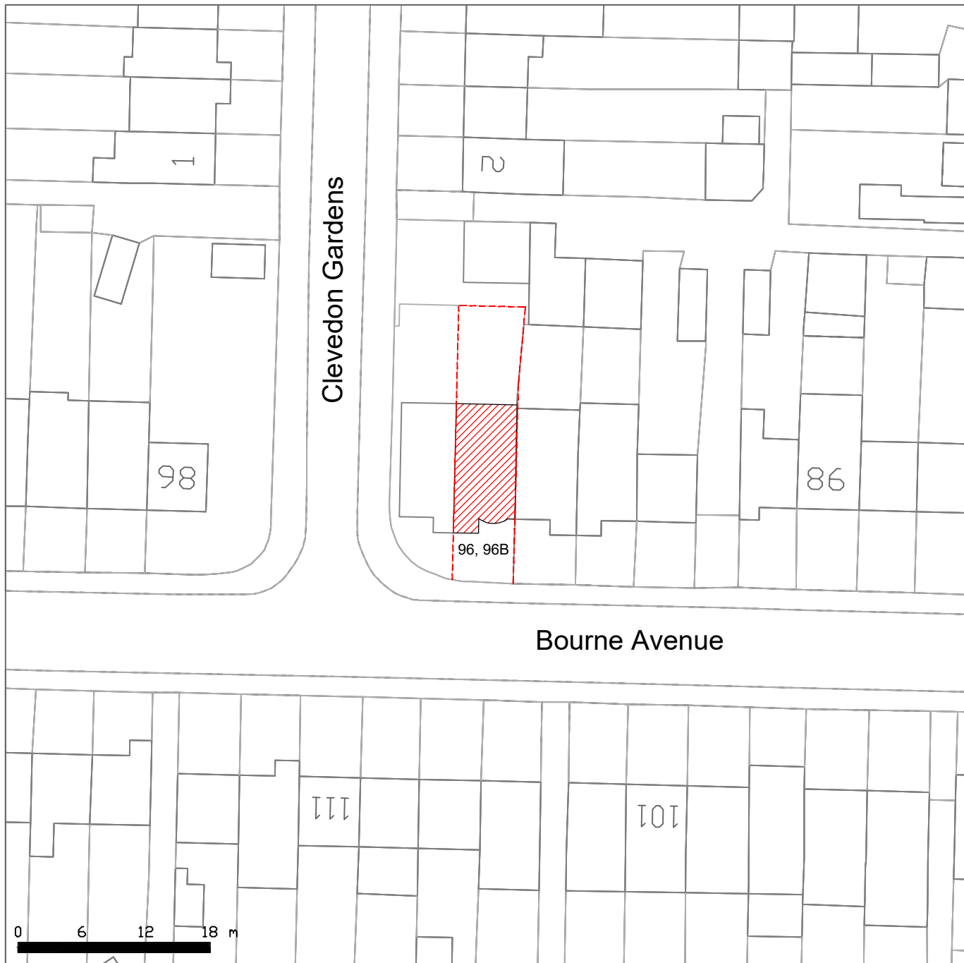
EXISTING SITE LOCATION PLAN

CONTRACTOR TO ENSURE THAT THE FIRE ALARM SHOULD BE A SELF CONTAINED SYSTEMS MEETING THE REQUIREMENTS OF 1.10 TO 1.18 OF AD B VOLUME 1 AND BS 5839-6. AOV IS PROVIDED AT THE HEAD OF THE STAIRCASES. THIS NEEDS TO BE SERVICED AND MAINTAINED AT LEAST ONCE A YEAR TO CONFORM TO BS7346, BS5588 AND EN12101. AOV IS TO BE PROVIDED WITH MANUAL OVERRIDE CONTROL AT THE GROUND FLOOR LEVEL.