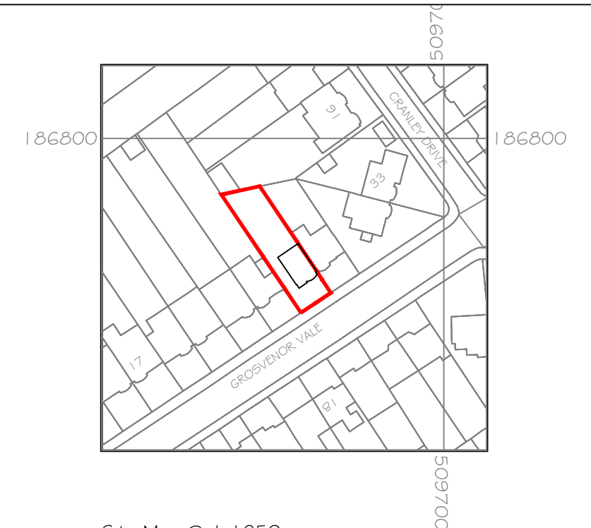
Site Map @ 1:1250