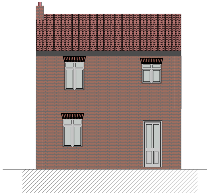
PROPOSED FRONT ELEVATION 1:100 ①