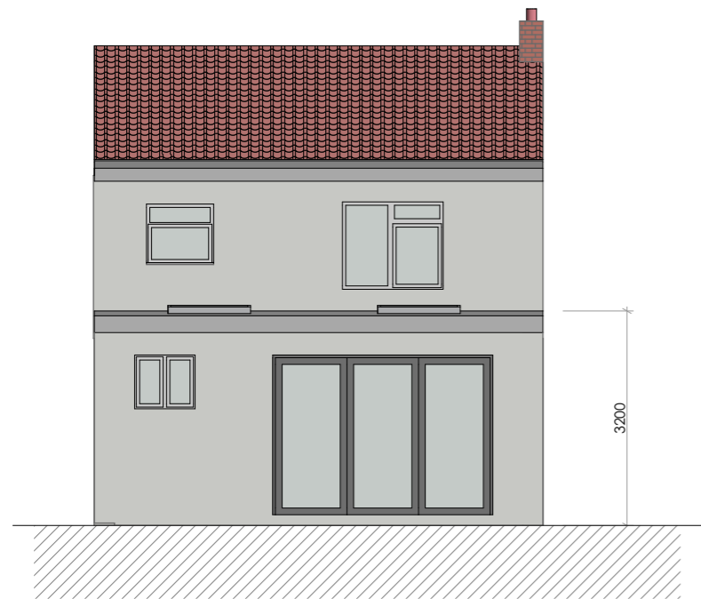
PROPOSED REAR ELEVATION 1:100 ②