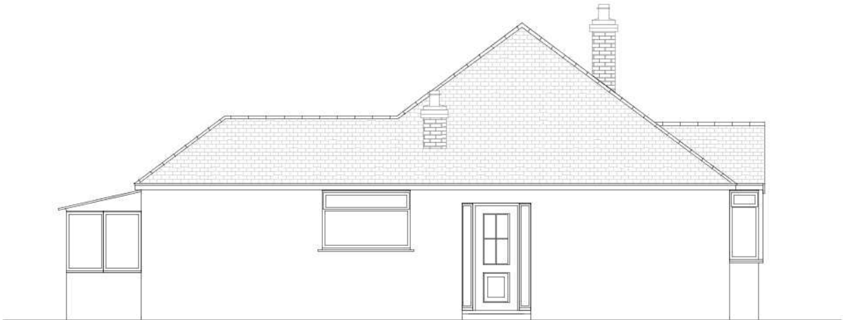
Existing Side Elevation Viewed from No. 38