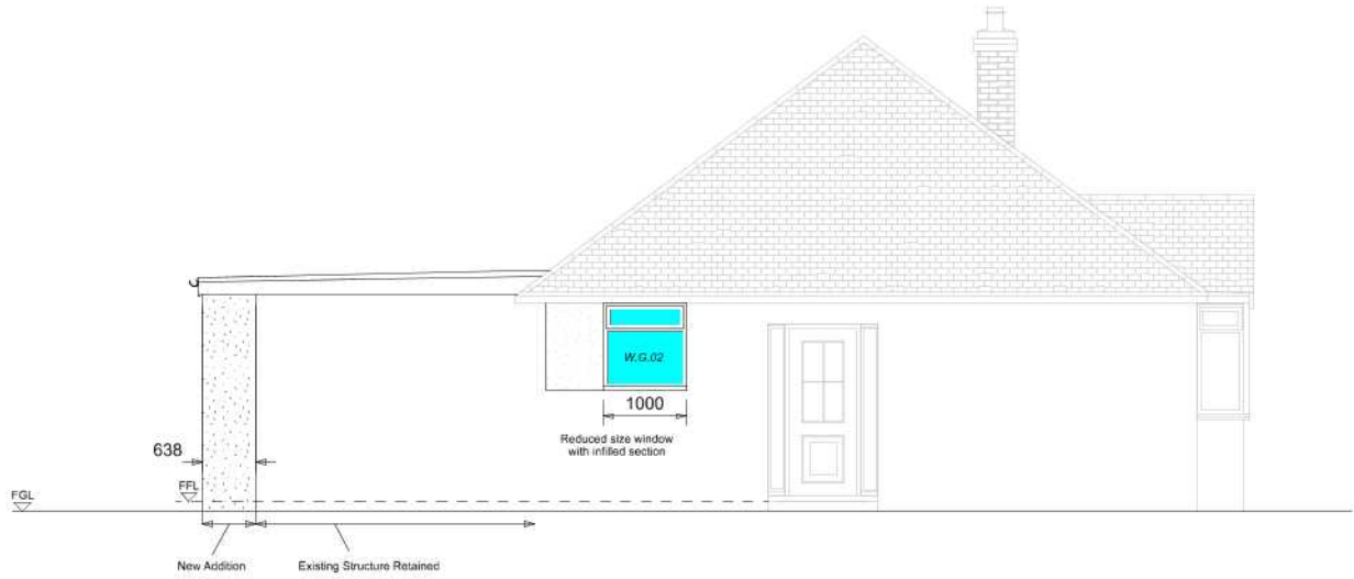
Proposed Side Elevation Viewed from No. 38