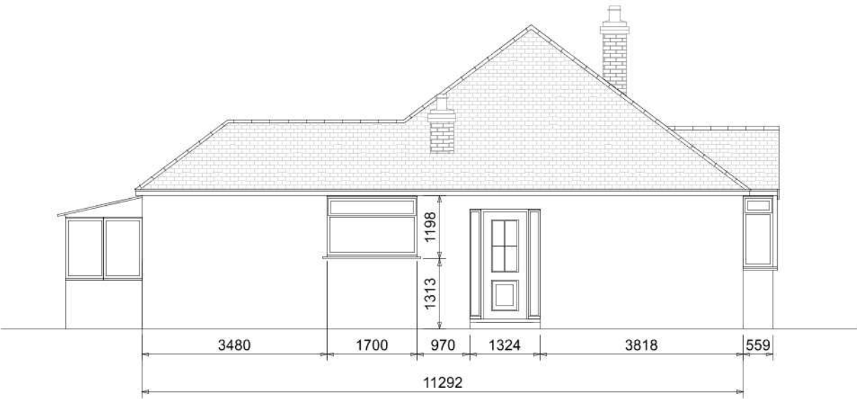
Side Elevation Viewed from No. 38