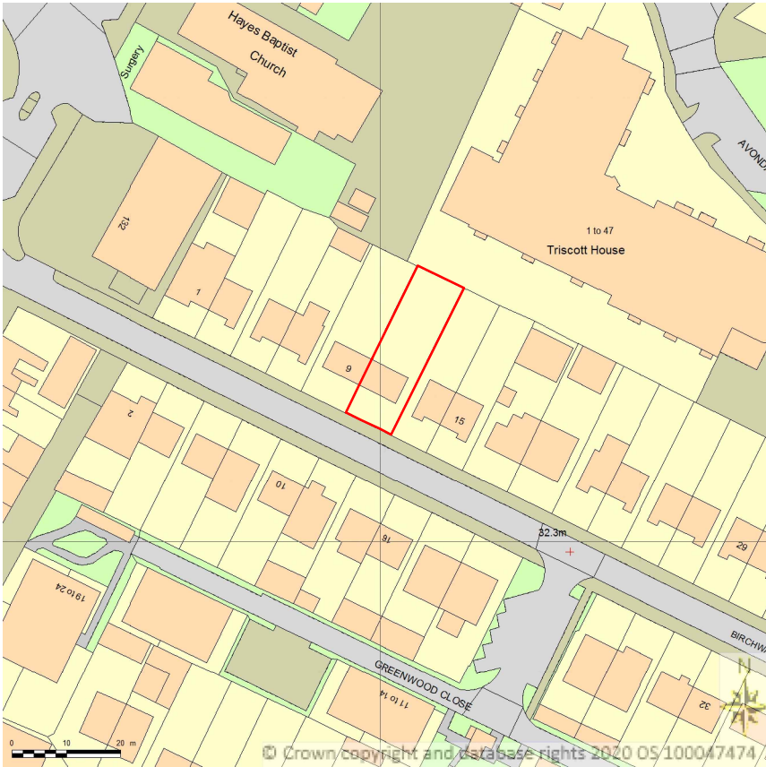
Location Plan@ 1:1250

Single Storey Rear Extension and Part First Floor Rear Extension