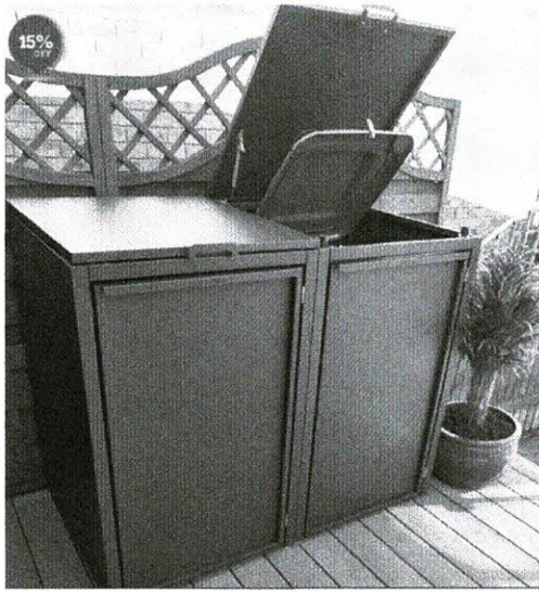
Double Bin Store

https://ctybox.co.uk/collections/loft/products/hatch-steel?variant=40895443533986