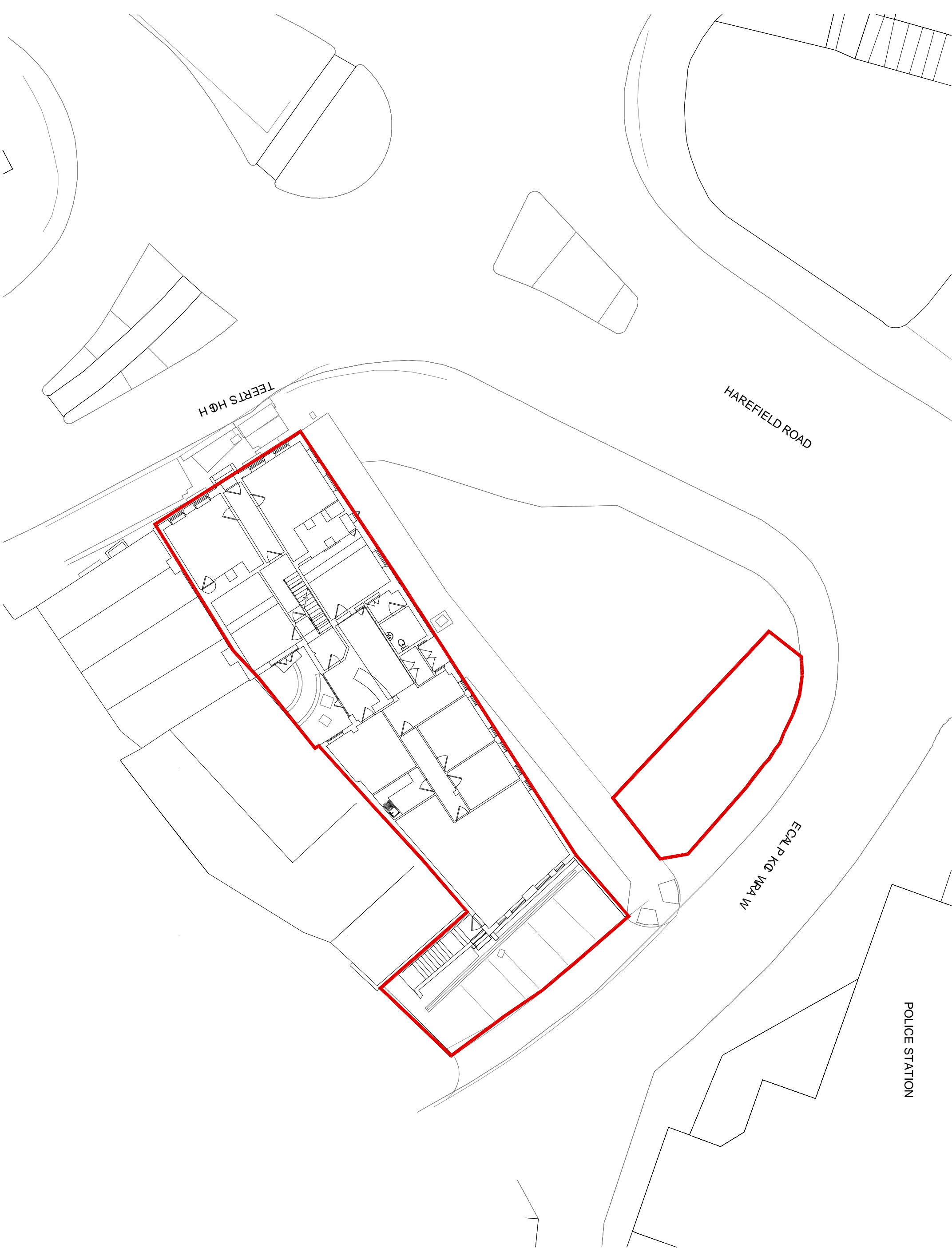
1 Existing Site Plan Scale: 1:200

Planning Drawings These drawings are prepared for planning purposes only. The level of detail contained on this drawing being relevant to its scale and purpose.