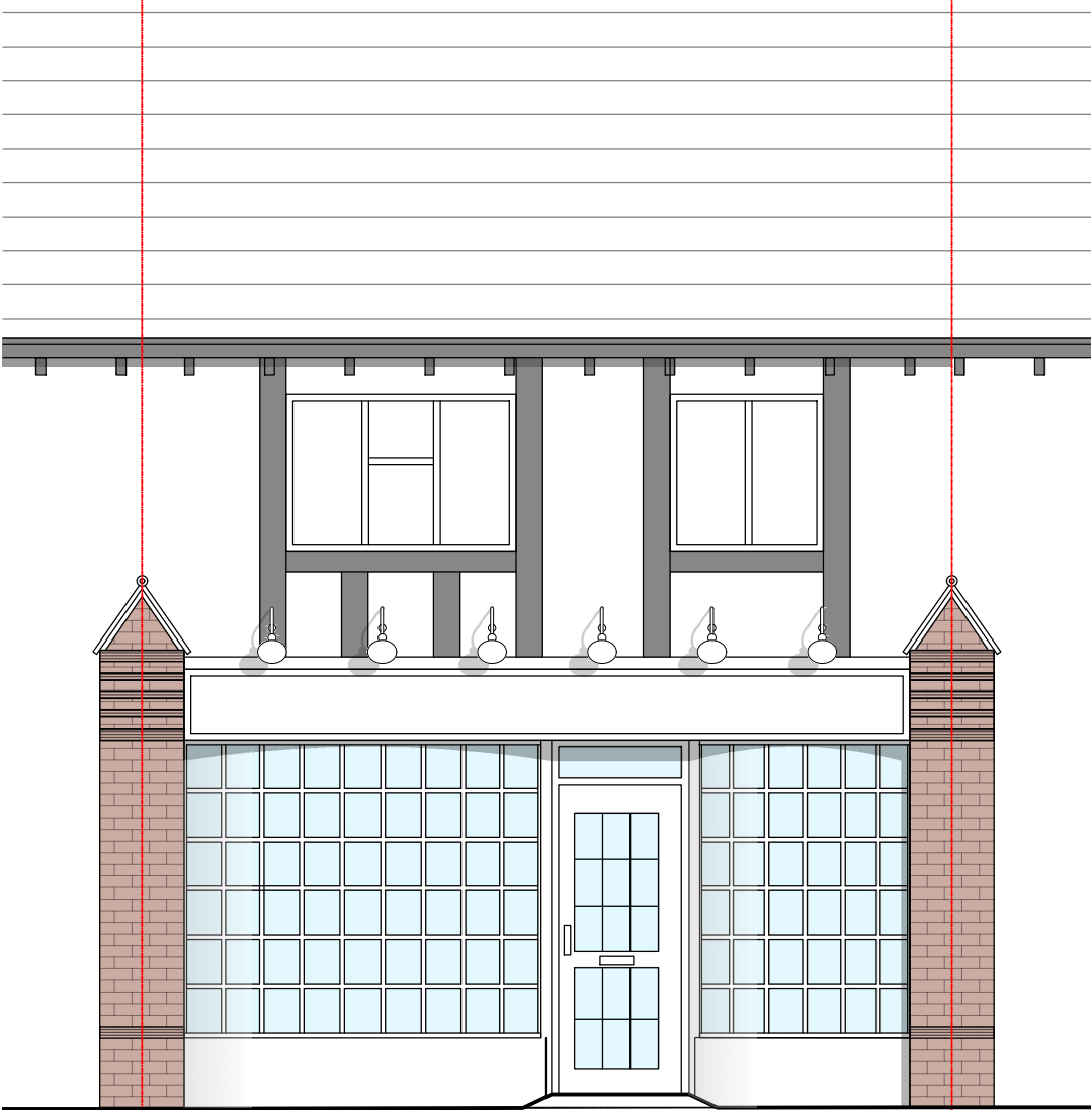
PRE-EXISTING FRONT ELEVATION