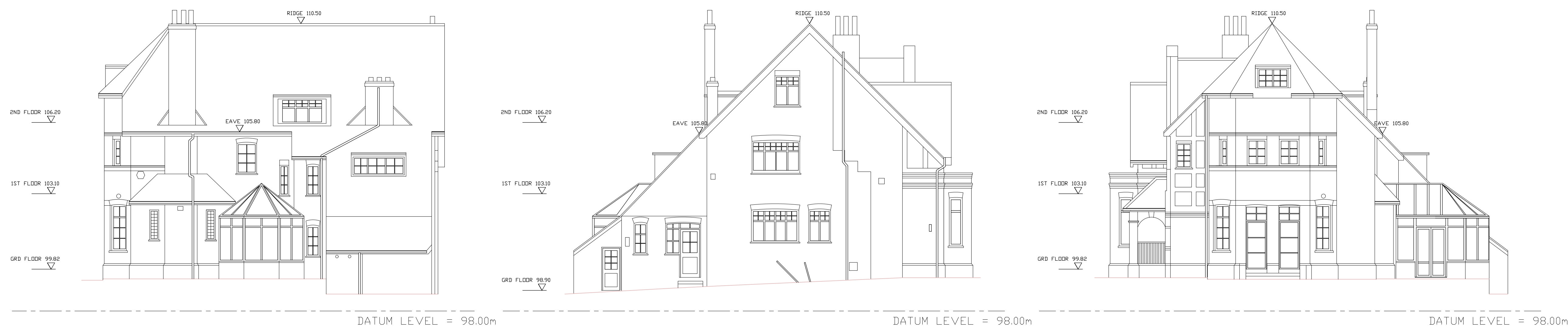
2 EXISTING REAR ELEVATION 5698 PL 101 1:100 @ A1