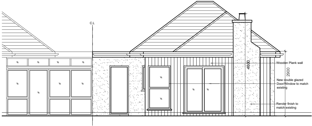
02 - REAR ELEVATION