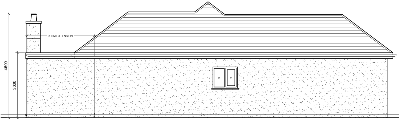
01 - LEFT SIDE ELEVATION