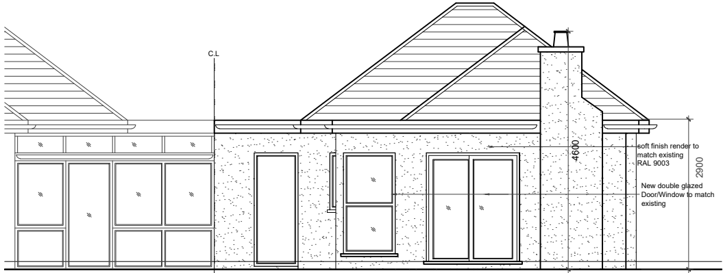
02 - REAR ELEVATION