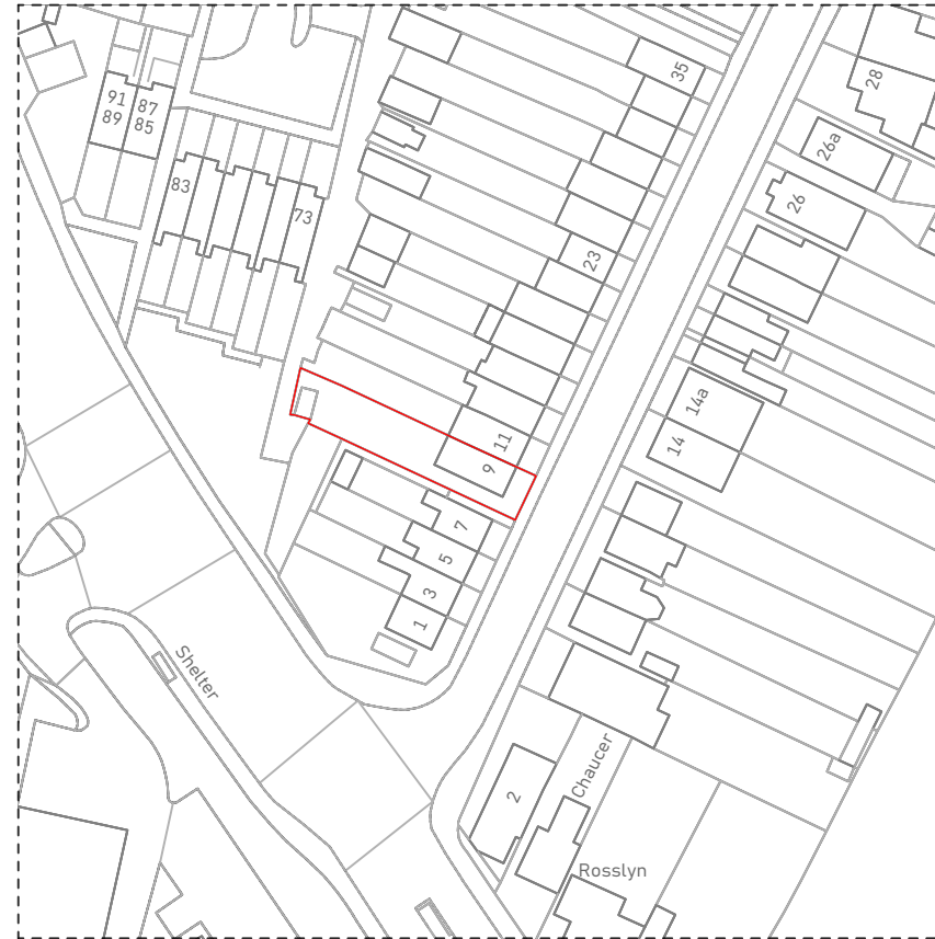
2 Location Plan Scale: 1:1250