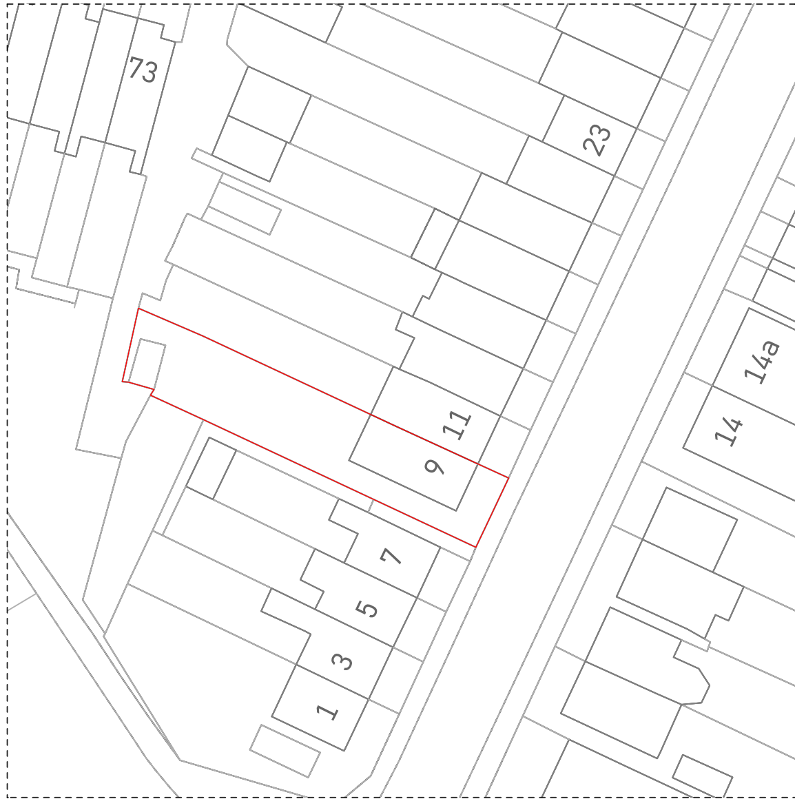
1 Block Plan Scale: 1:500