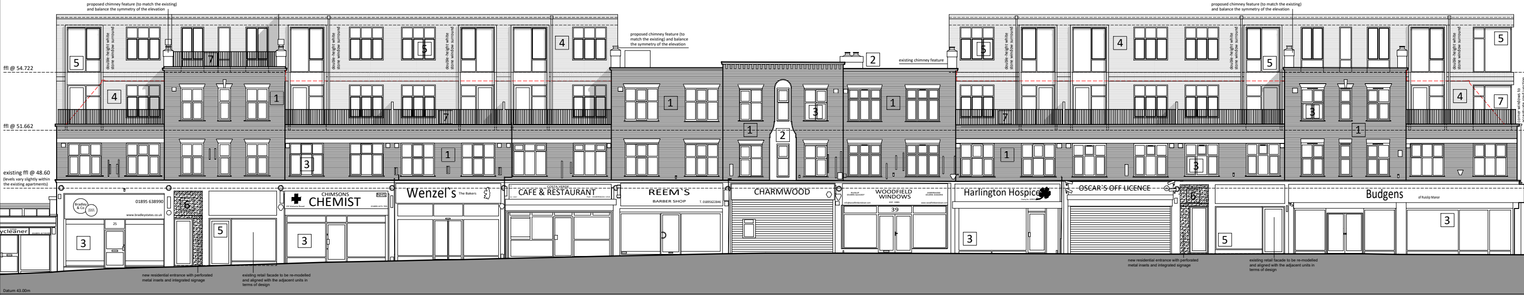
elevation 1 | front (victoria road streetscene)